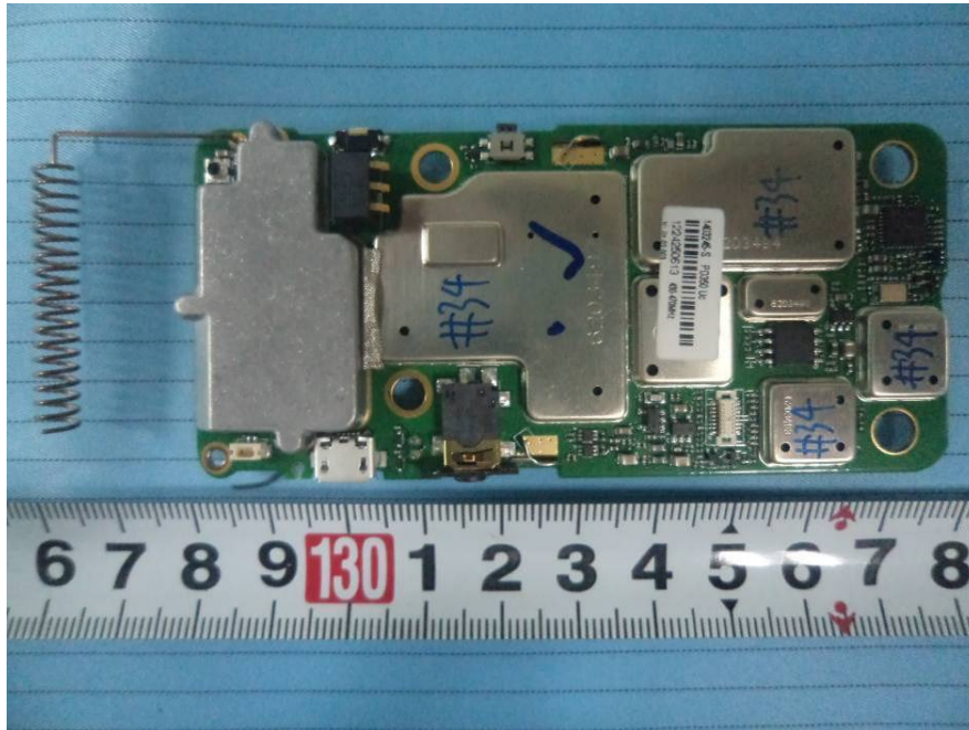
EUT – Main Board Bottom Shielding off View