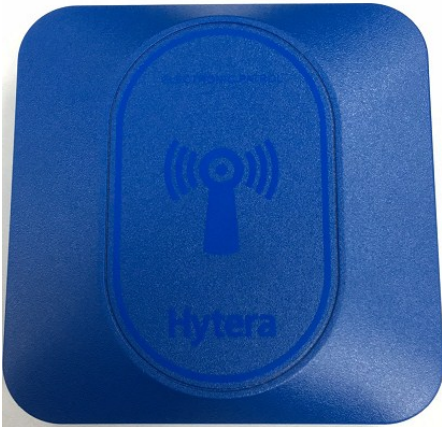
GTW-RFID_IN/OUT Patrol Beacon