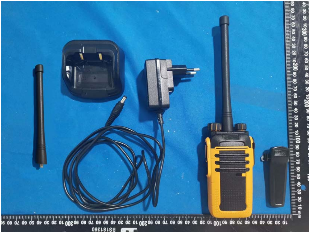
EXHIBIT B - EUT EXTERNAL PHOTOGRAPHS