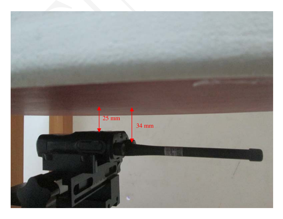
Face up (2.5cm)

Note : This test report is prepared for the customer shown above and for the equipment described herein. It may not be duplicated or used in part without prior written consent from Bay Area Compliance Laboratories Corp.