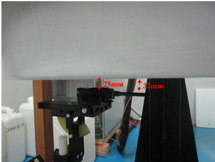
Body Worn Back Setup Photo(0mm)