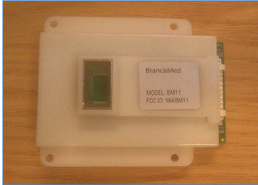
Figure 1: FCC ID Label on front of Sensor Module