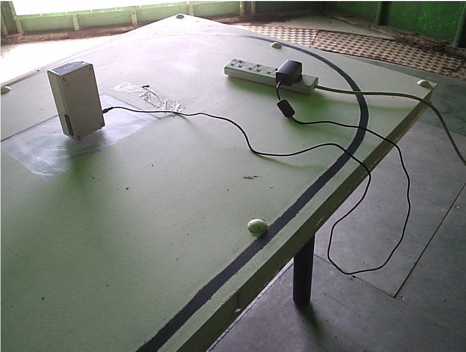
Figure 1: Radiated emissions setup on open area site