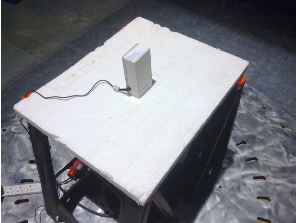
Figure 1: EUT on turntable