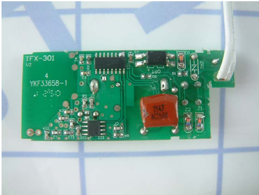
PCB 1 side1

Copyright of this report is owned by Centre of Testing Service and may not be reproduced other than in full except with the written approval of the issuing Company.