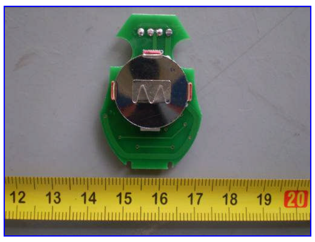
Rear View of PCB