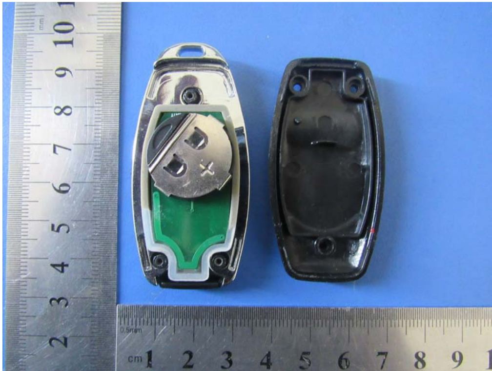
EUT Uncover- Front View