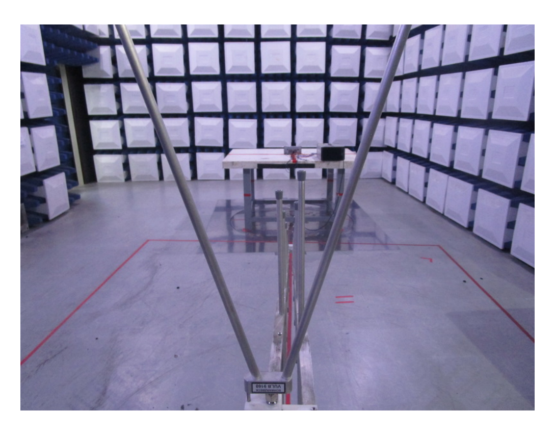
Report No.: BTL-FCCP-1-1809C179