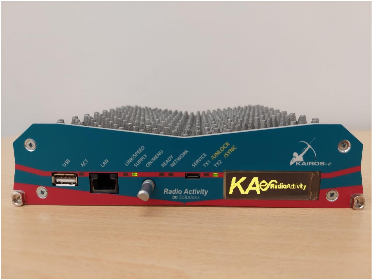
Front view (panel on)