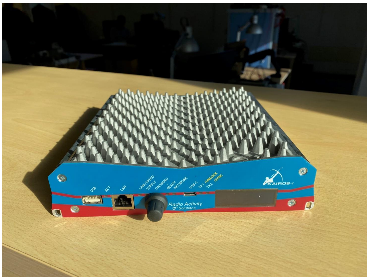
Front view (up)