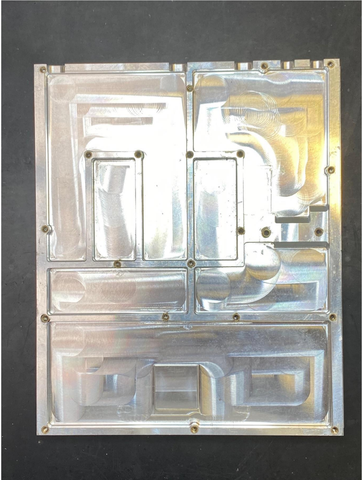
KA-160e Heatsink in