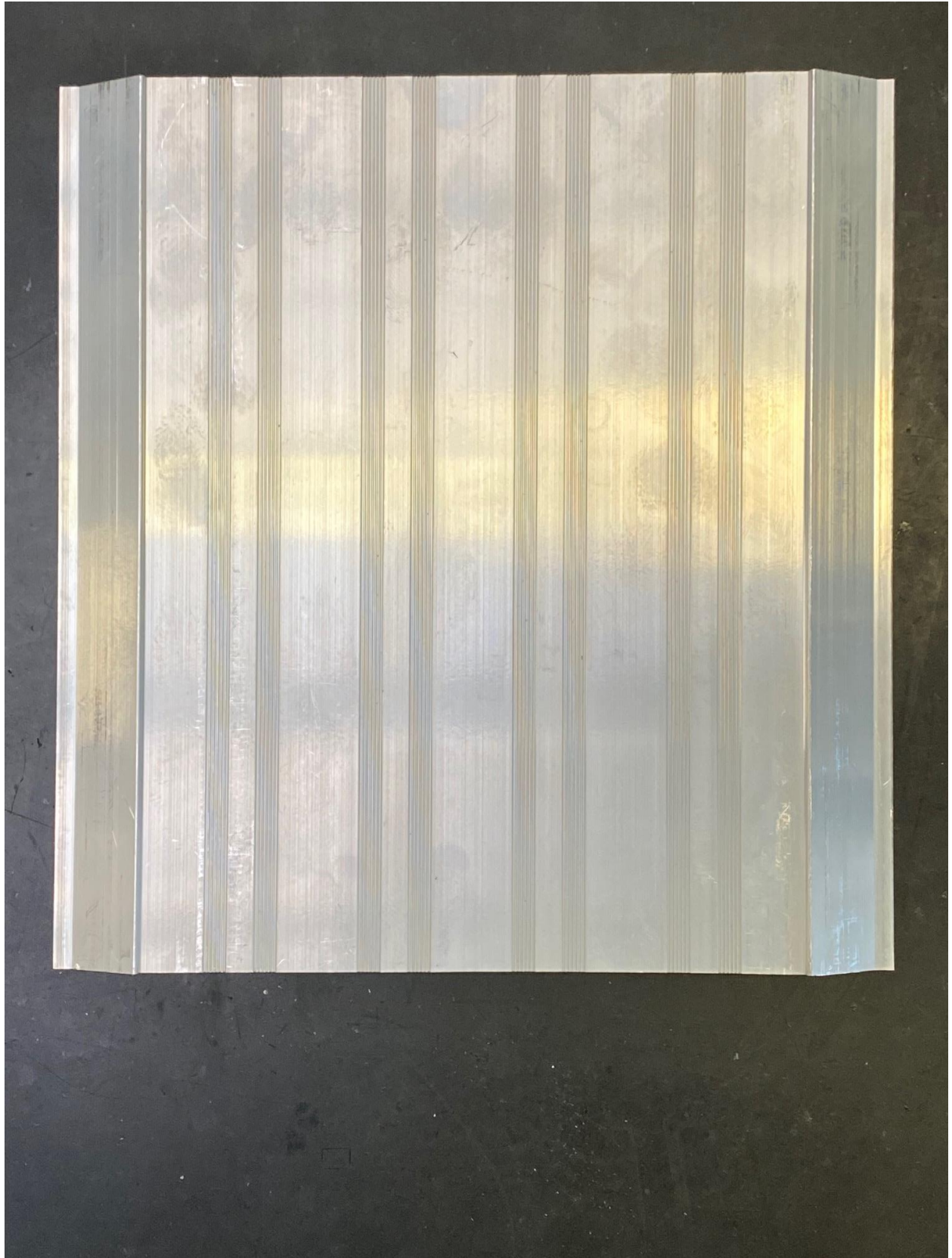
KA-160e Cover out