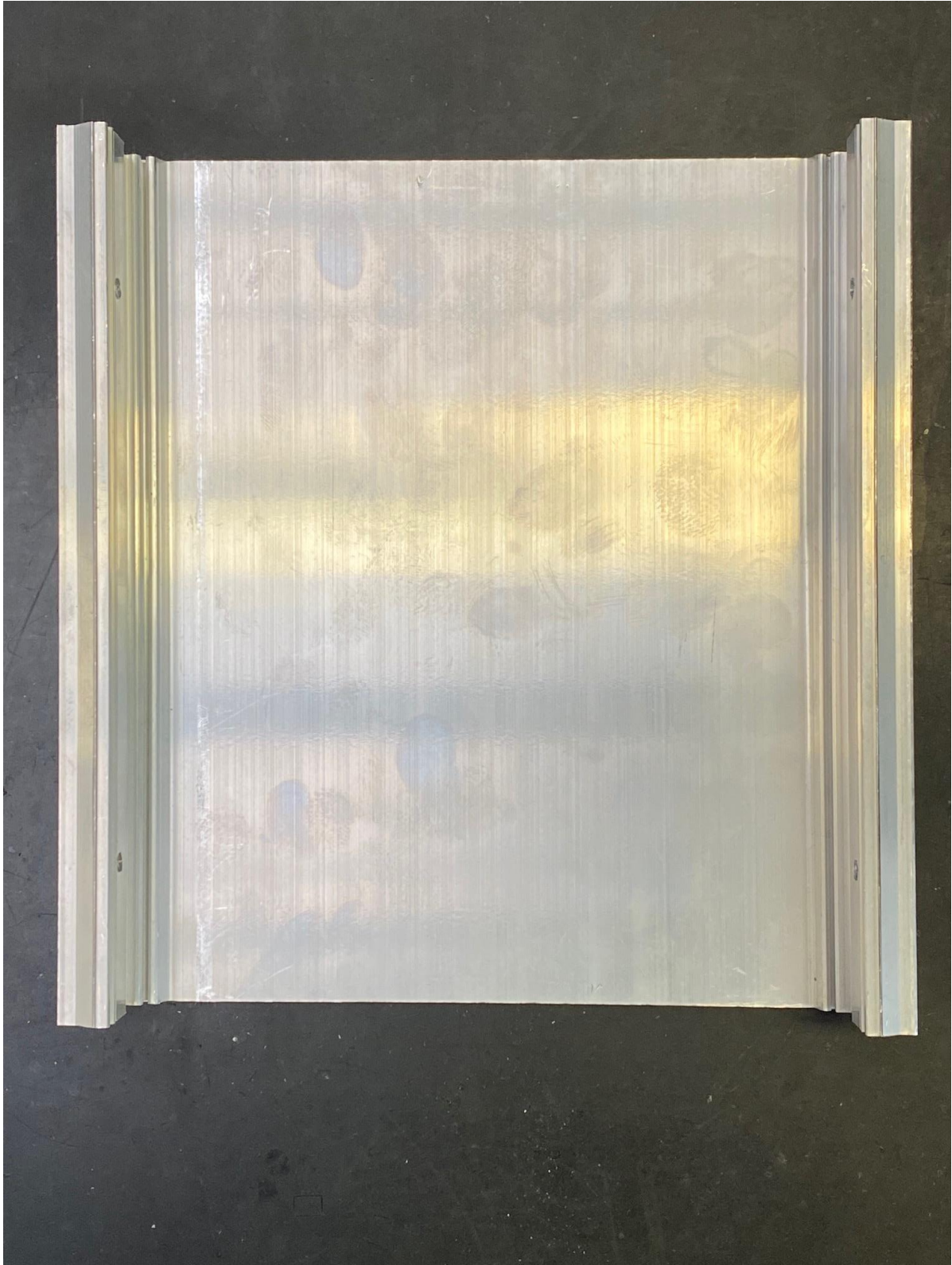
KA-160e Cover in