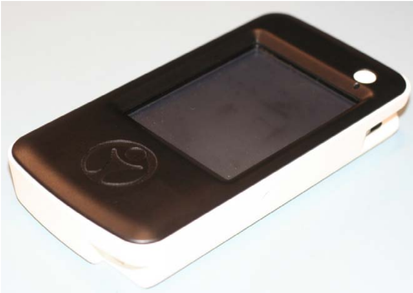
Bottom View Label Placement.