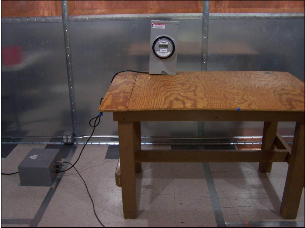
Photograph 1. Conducted Emissions, 15.207(a), Test Setup