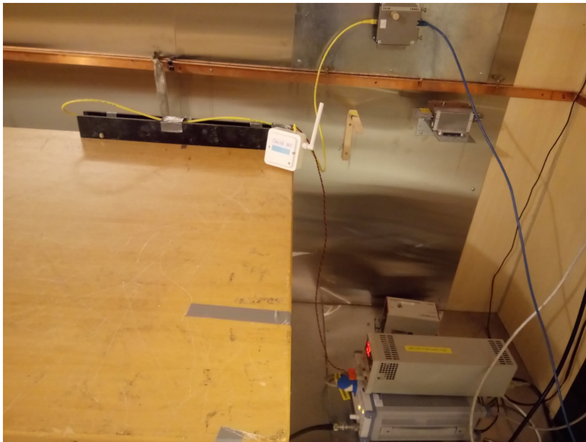
Conducted power emissions