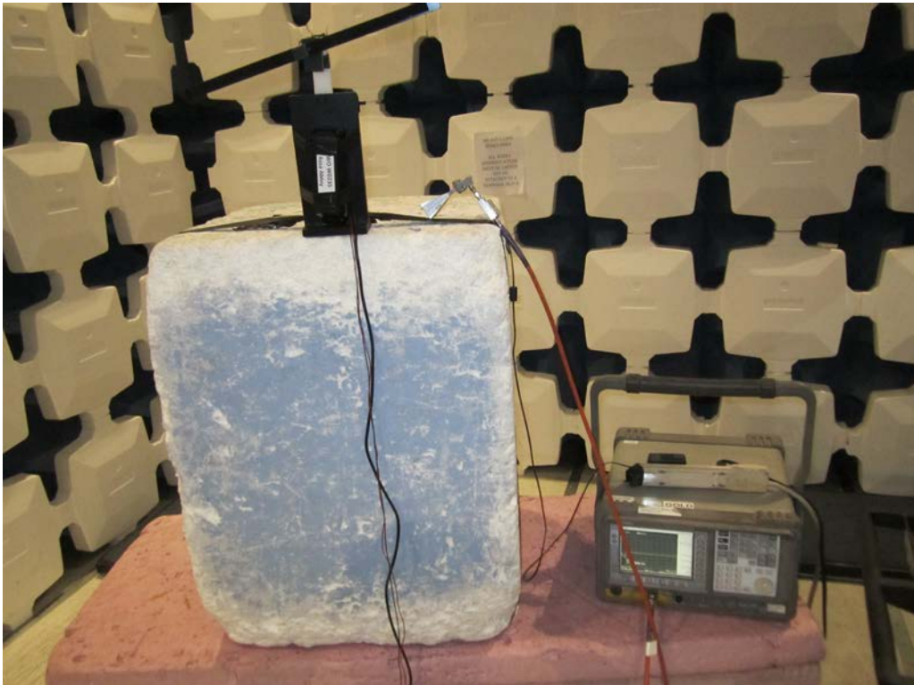
Radiated Emissions, 18-25GHz