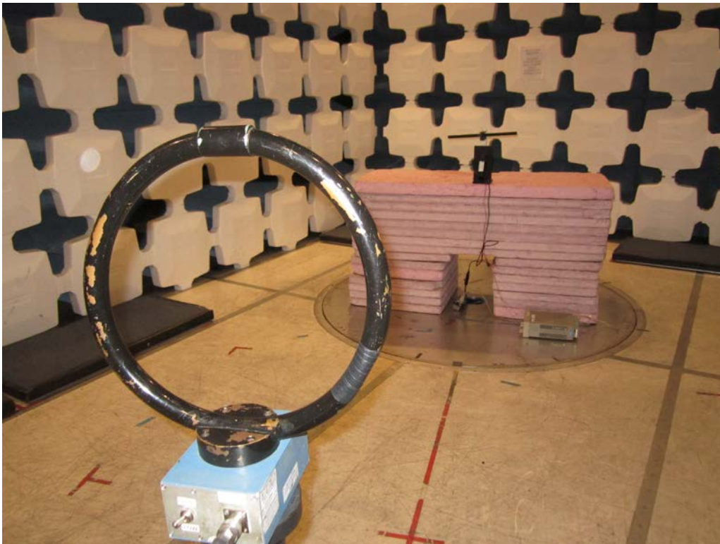
Radiated Emissions 1-30MHz