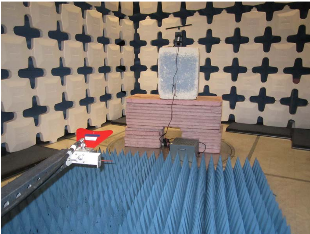
Radiated Emissions, 1-6GHz