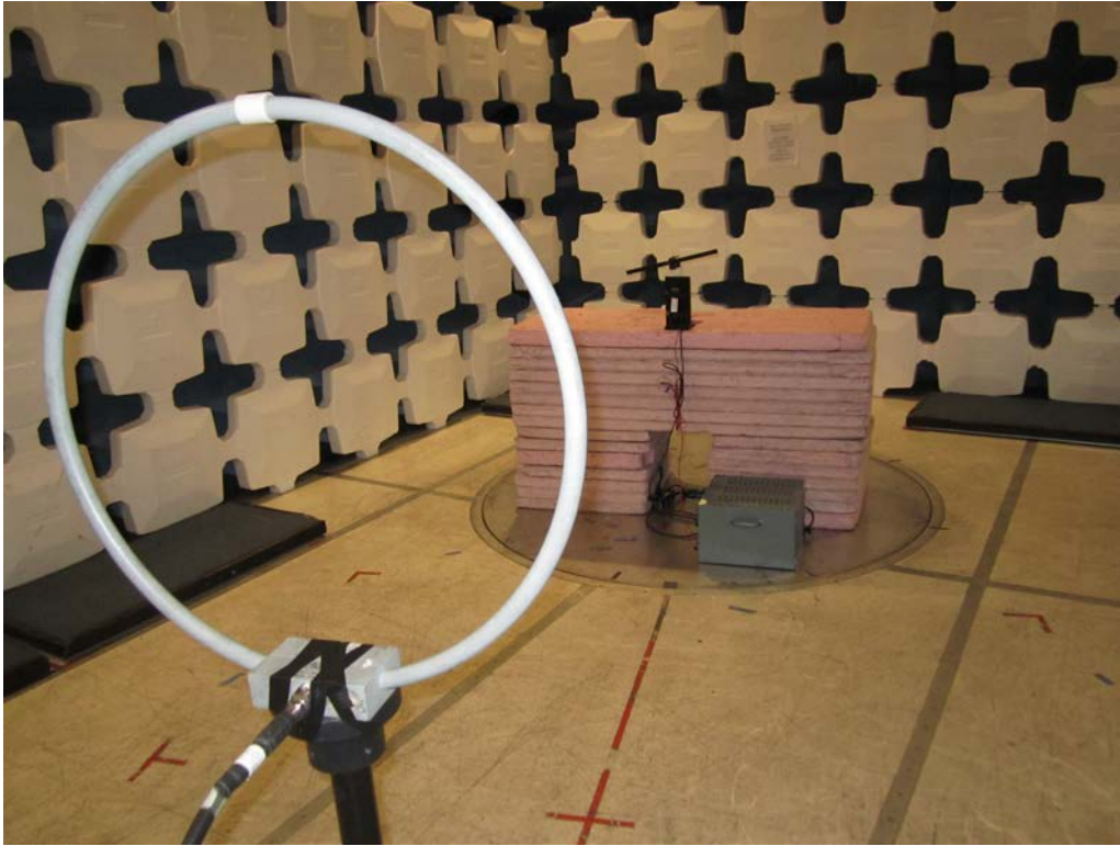
Radiated Emissions 9kHz-1MHz