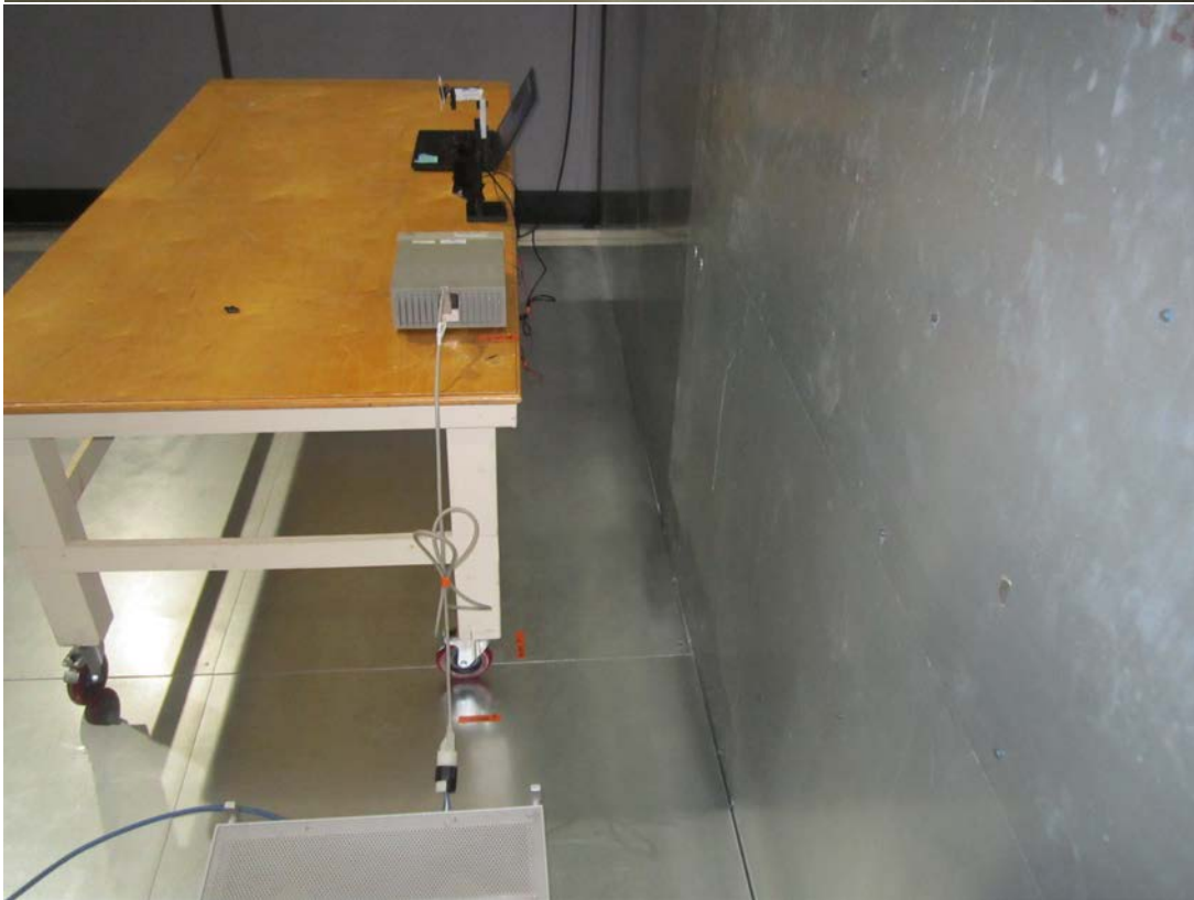
AC Line Conducted Emissions