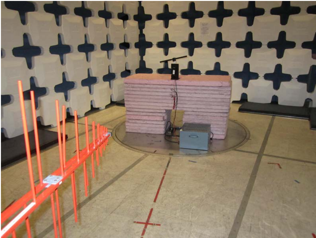
Radiated Emissions, 30-1000MHz