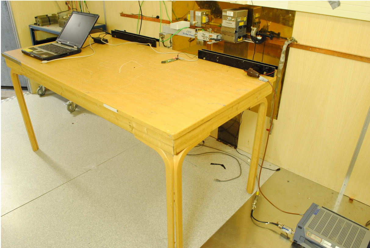
Power-line Conducted Emissions Test Set-up