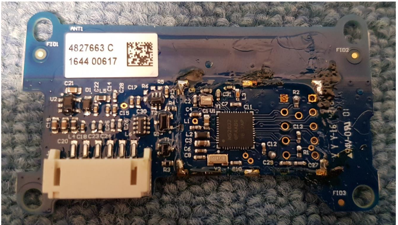
Top side with EMI shield removed