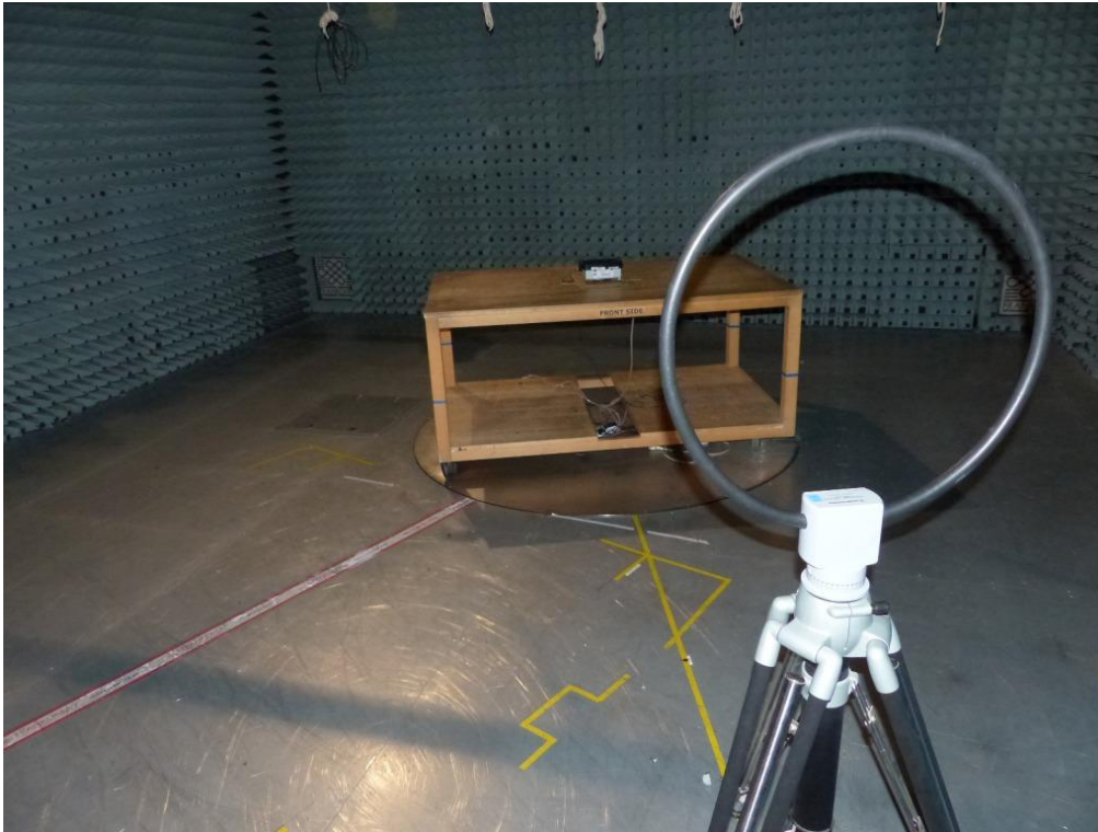
Photo 1: Test setup for radiated measurements (Enclosure, below 30 MHz, intentional radiator §15)