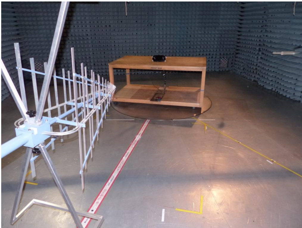
Photo 2: Test setup for radiated measurements (Enclosure, semi-anechoic chamber, 30 MHz to 1 GHz, intentional radiator §15)