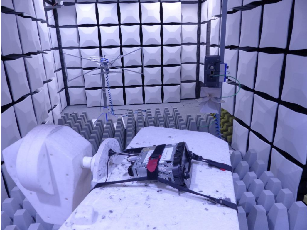
Photo 3: Test setup for radiated measurements (Enclosure, fully-anechoic chamber, 1-25 GHz intentional radiator §15)