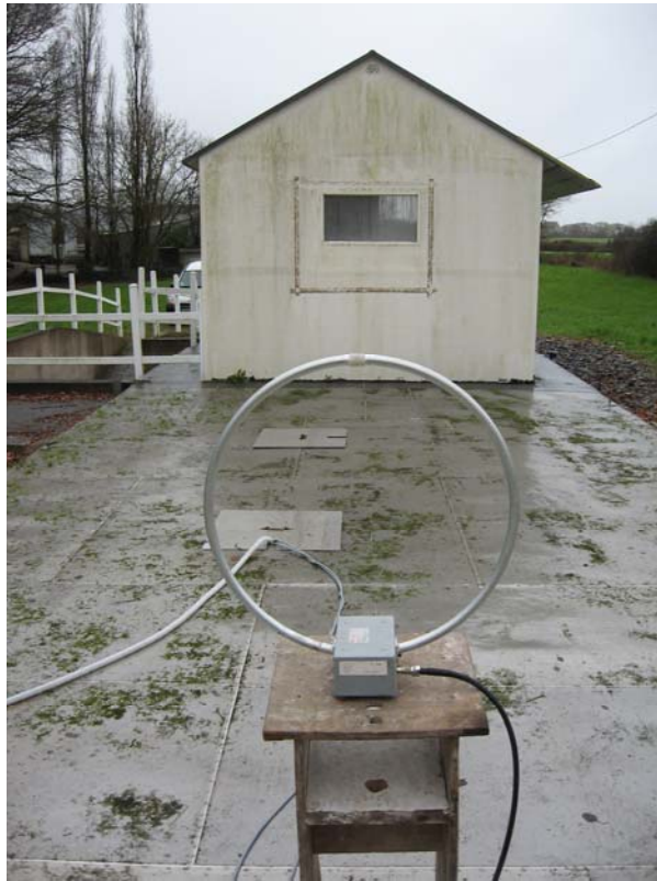
30 MHz – 200 MHz antenna