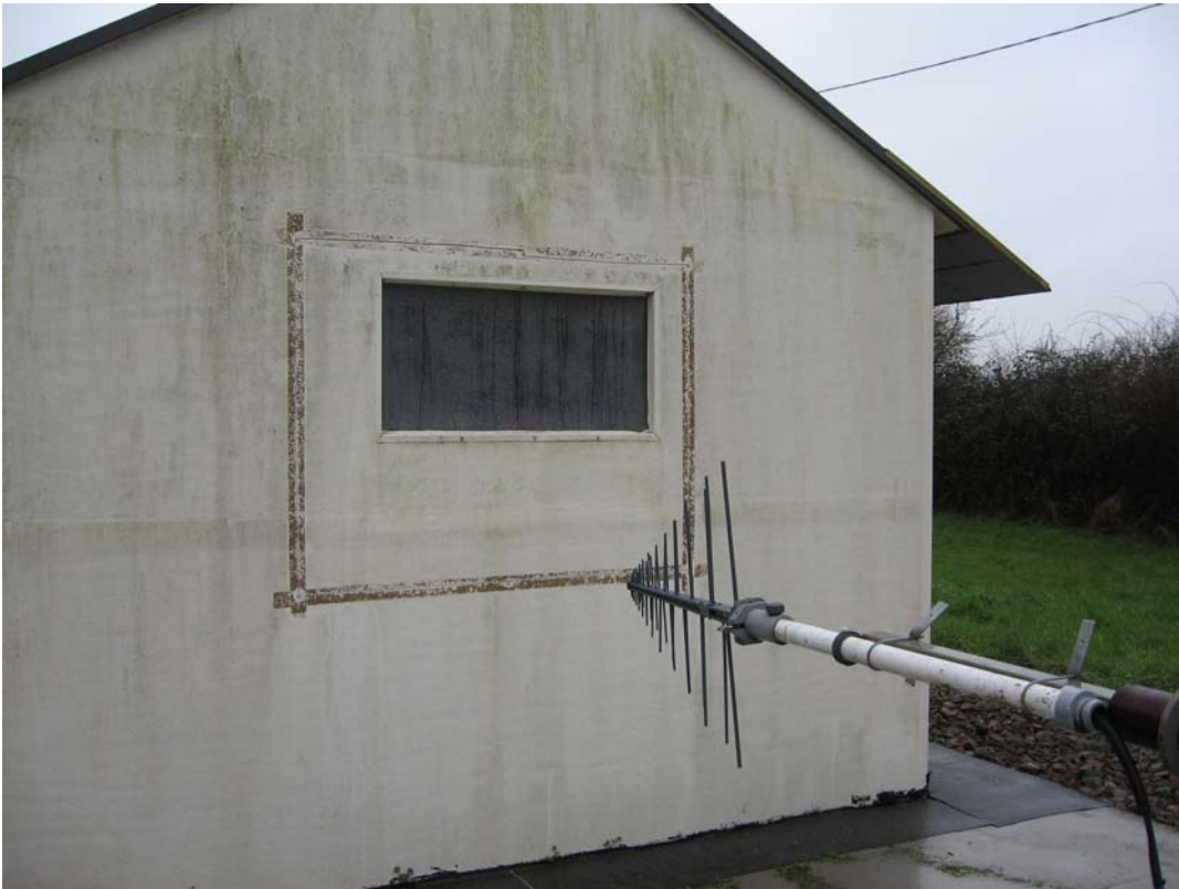
1 GHz – 18 GHz antenna