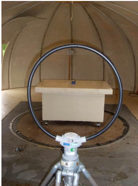
Test setup for radiated field strength