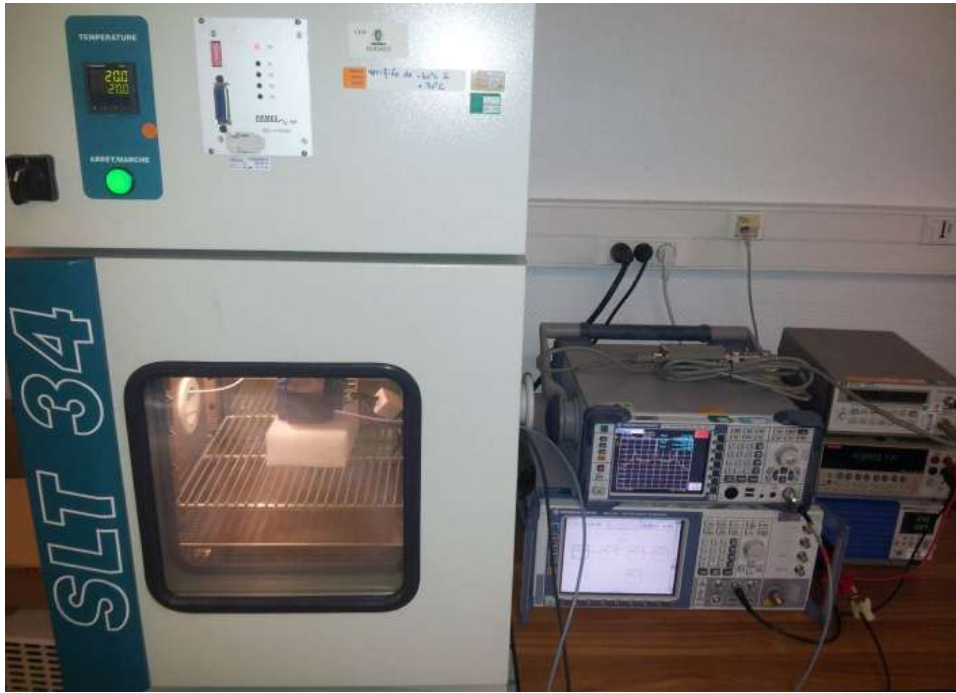
Test setup for frequency stability measurement in extreme conditions