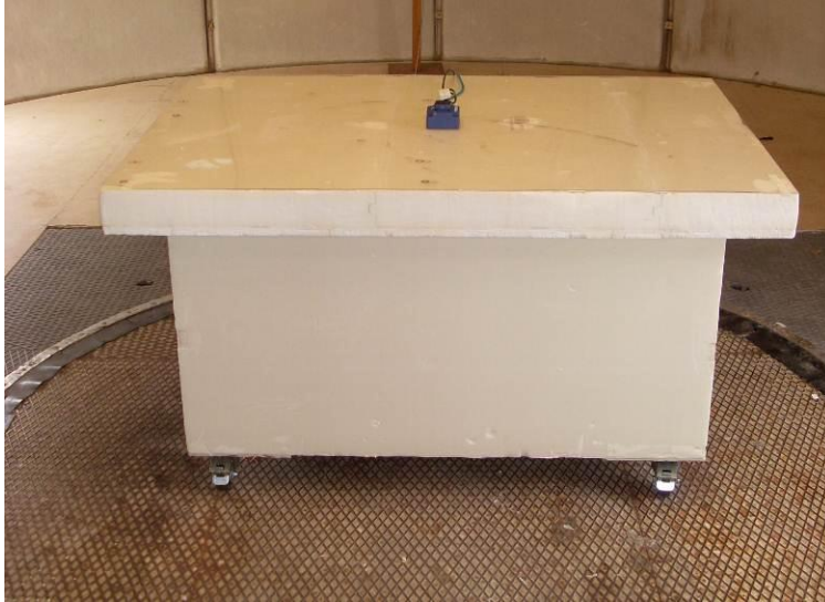
Test setup for radiated field strength