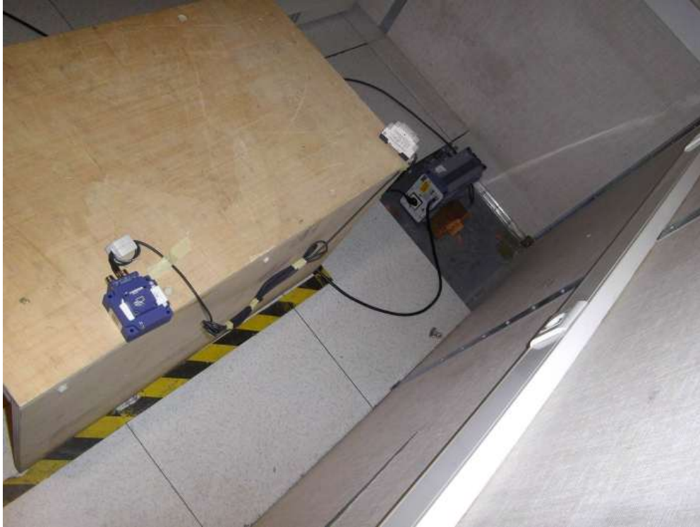
Test setup for power line conducted emissions