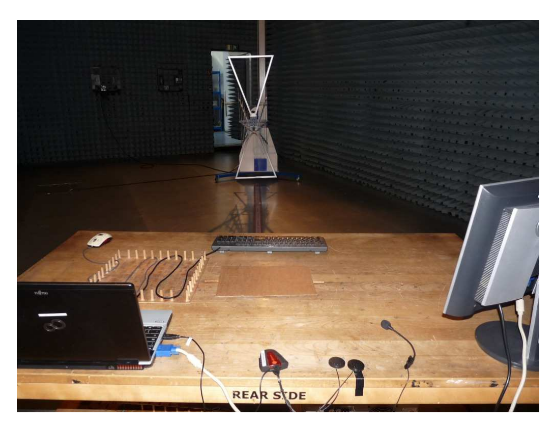
Photo 6: Test setup for radiated measurements (computer peripheral setup, EUT supplied by external DC power to enable USB data transfer to computer, unintentional radiator §15)