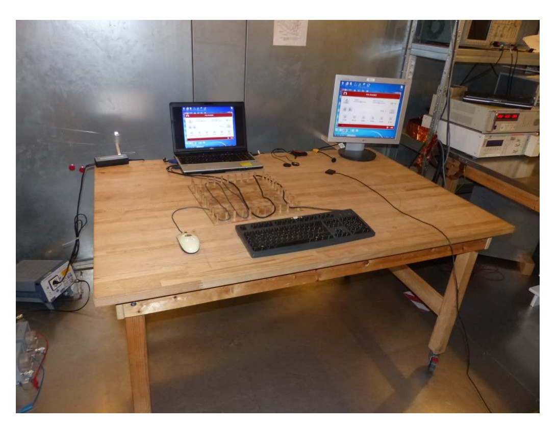
Photo 5: Test setup for conducted measurements (computer peripheral setup, EUT supplied by USB-cable from computer, charging mode, unintentional radiator §15)