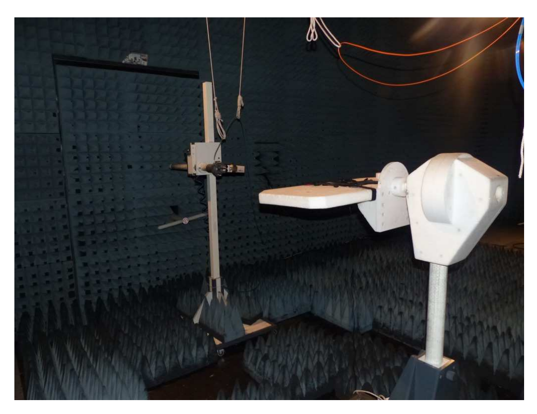
Photo 4: Test setup for radiated measurements (Enclosure, fully-anechoic chamber, 18-25 GHz, intentional radiator § 15.247)