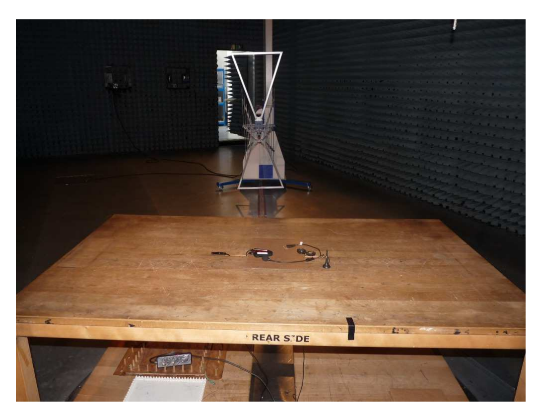
Photo 2: Test setup for radiated measurements (Enclosure, semi-anechoic chamber, 30 MHz to 1 GHz, intentional radiator §15)