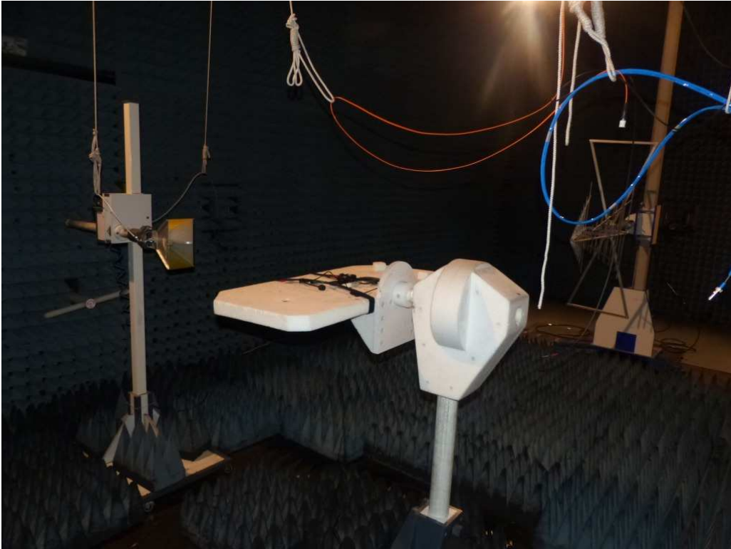
Photo 3: Test setup for radiated measurements (Enclosure, fully-anechoic chamber, 1-18 (15) GHz intentional radiator §15)