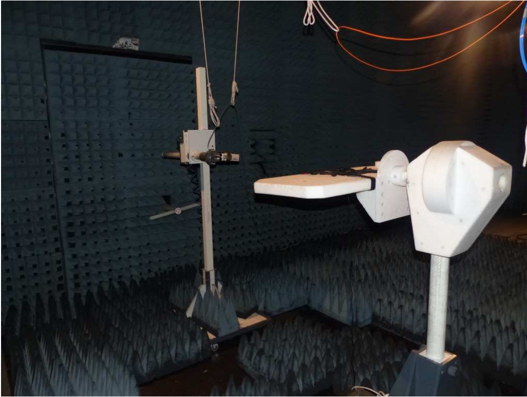
Photo 4: Test setup for radiated measurements (Enclosure, fully-anechoic chamber, 18-25 GHz, intentional radiator § 15.247)