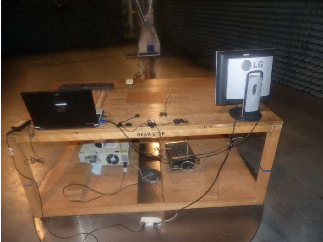
Photo 6: Test setup for radiated measurements (computer peripheral setup, EUT supplied by external DC power to enable USB data transfer to computer, unintentional radiator §15)