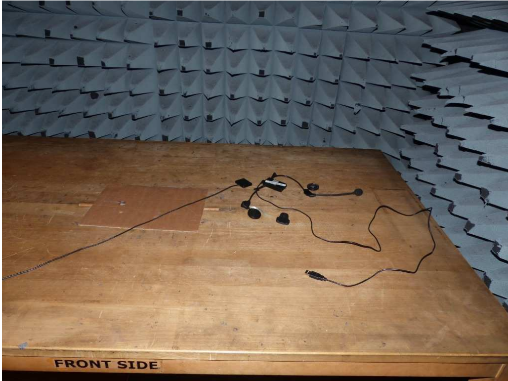
Photo 1: Test setup for radiated measurements (Enclosure, below 30 MHz, intentional radiator §15)