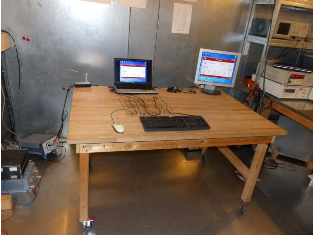
Photo 5: Test setup for conducted measurements (computer peripheral setup, EUT supplied by USB-cable from computer, charging mode, unintentional radiator §15)