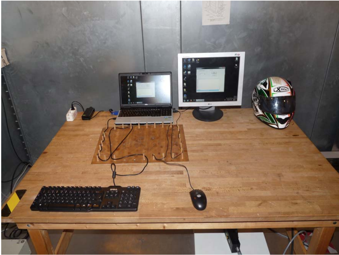
Photo 5: Test setup for conducted measurements (AC Port (power line)), unintentional transmission, EUT + computer peripheral setup