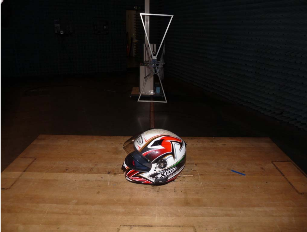
Photo 2: Test setup for radiated measurements (Enclosure, 30 MHz to 1 GHz), intentional transmission