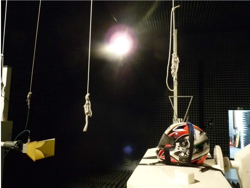
Photo 3: Test setup for radiated measurements (Enclosure, above 1 GHz)