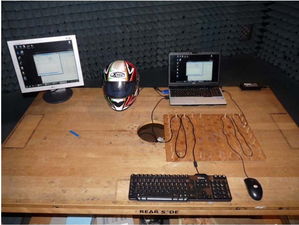
Photo 7: Test setup for radiated measurements (Enclosure, 30 MHz to 1 GHz), unintentional transmission, EUT + computer peripheral setup