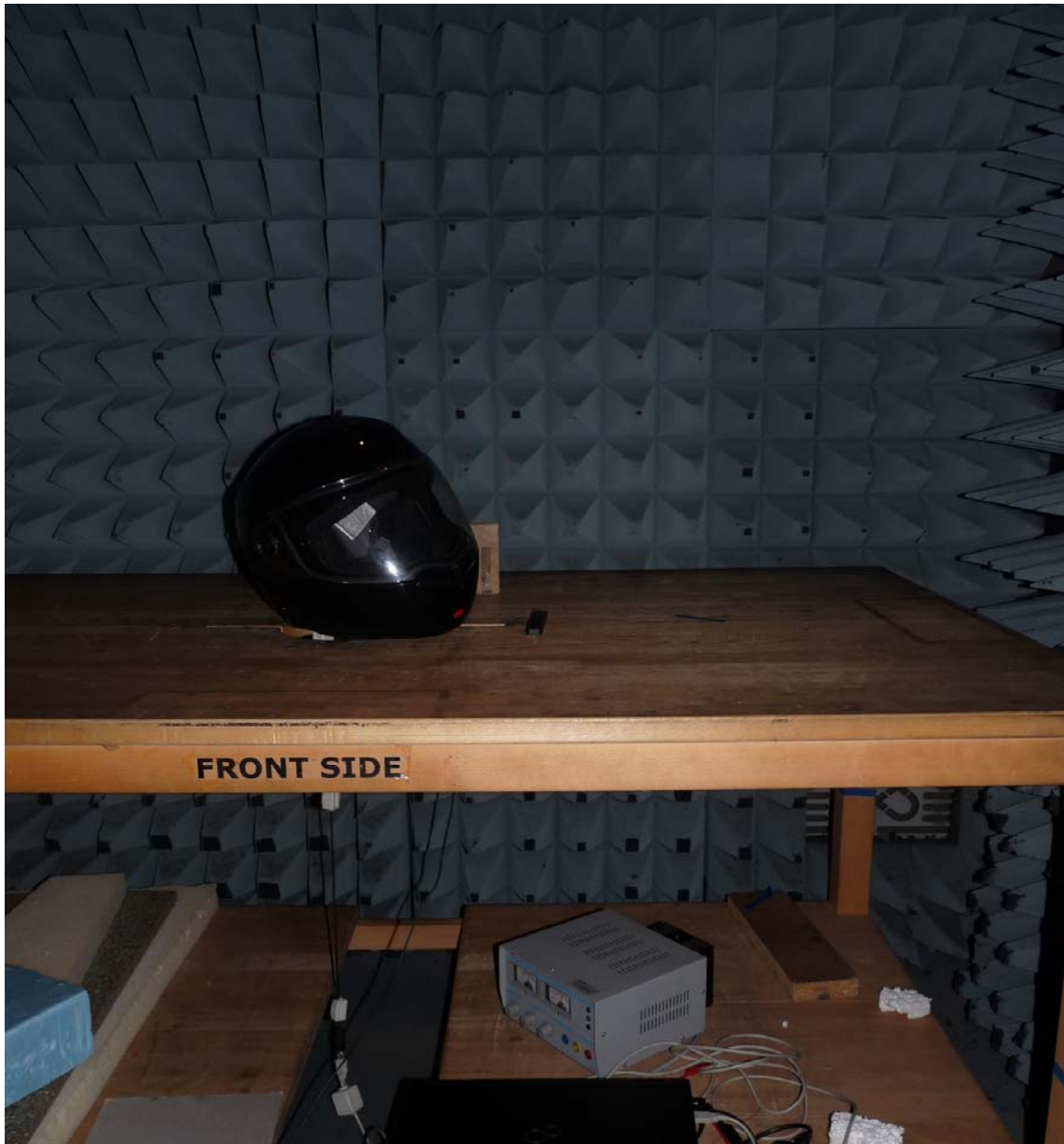
Photo 1: Test setup for radiated measurements (Enclosure, below 30 MHz) Part 15c