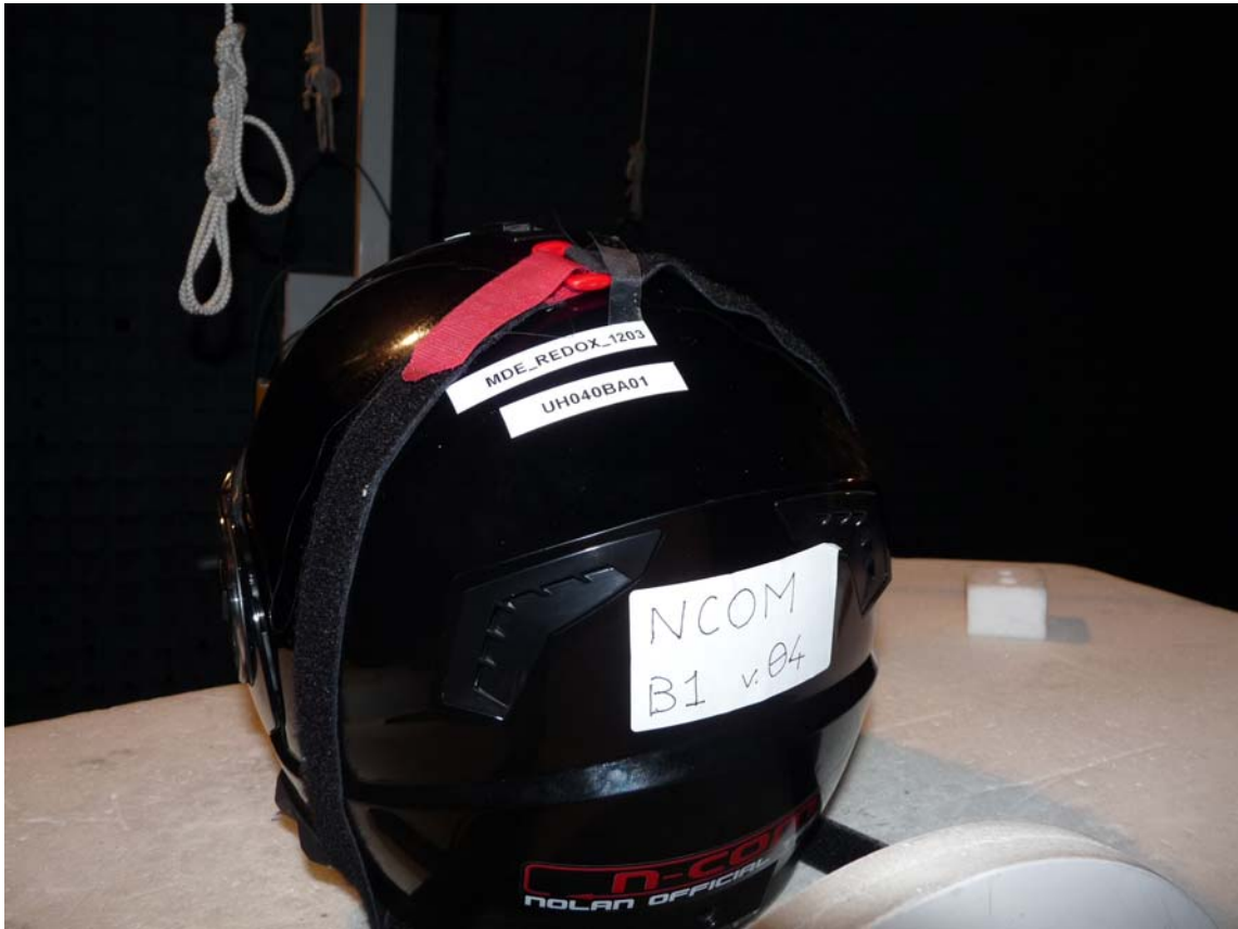
Photo 3: Test setup for radiated measurements (Enclosure, above 1 GHz)