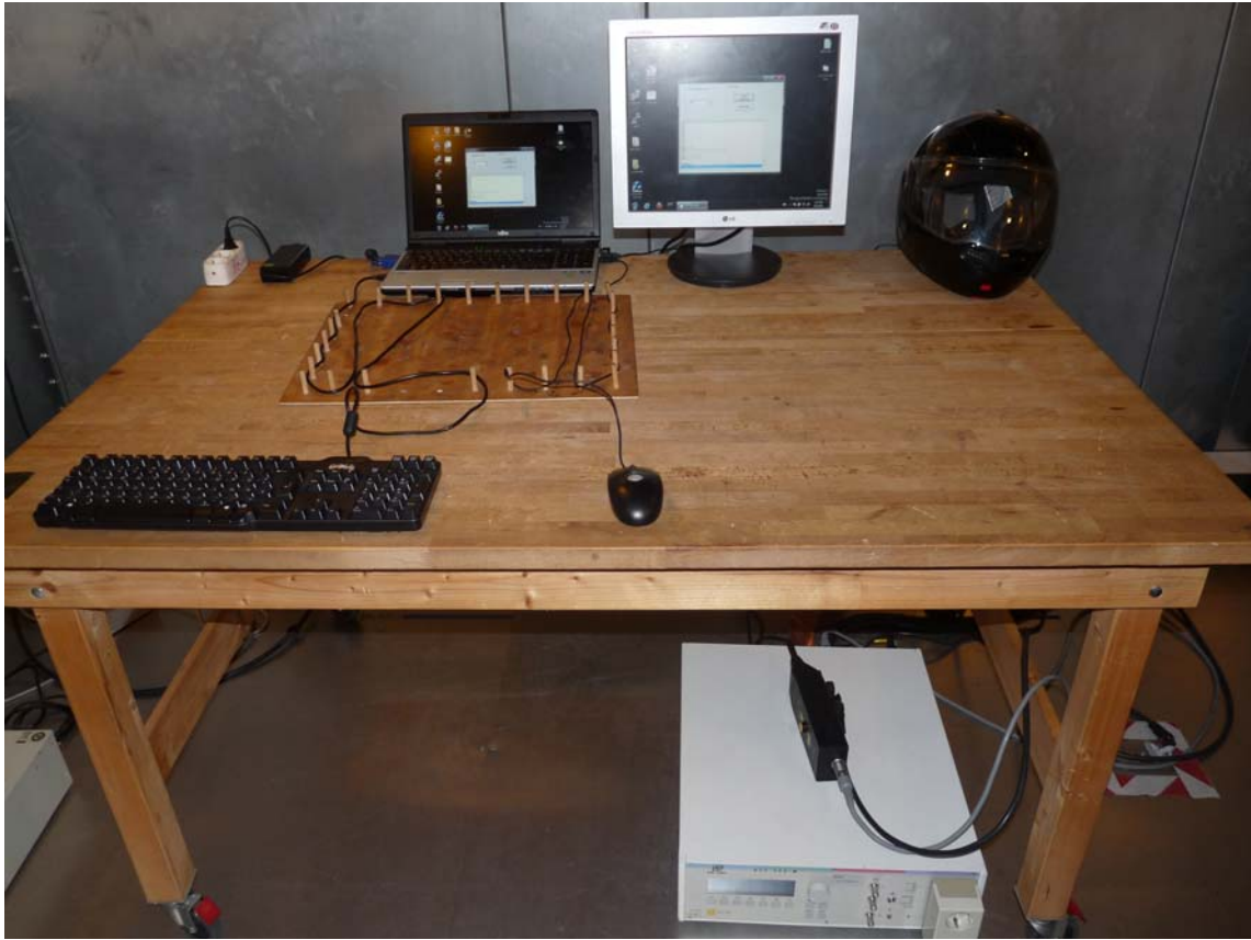
Photo 5: Test setup for conducted measurements (AC Port (power line)), unintentional transmission, EUT + computer peripheral setup