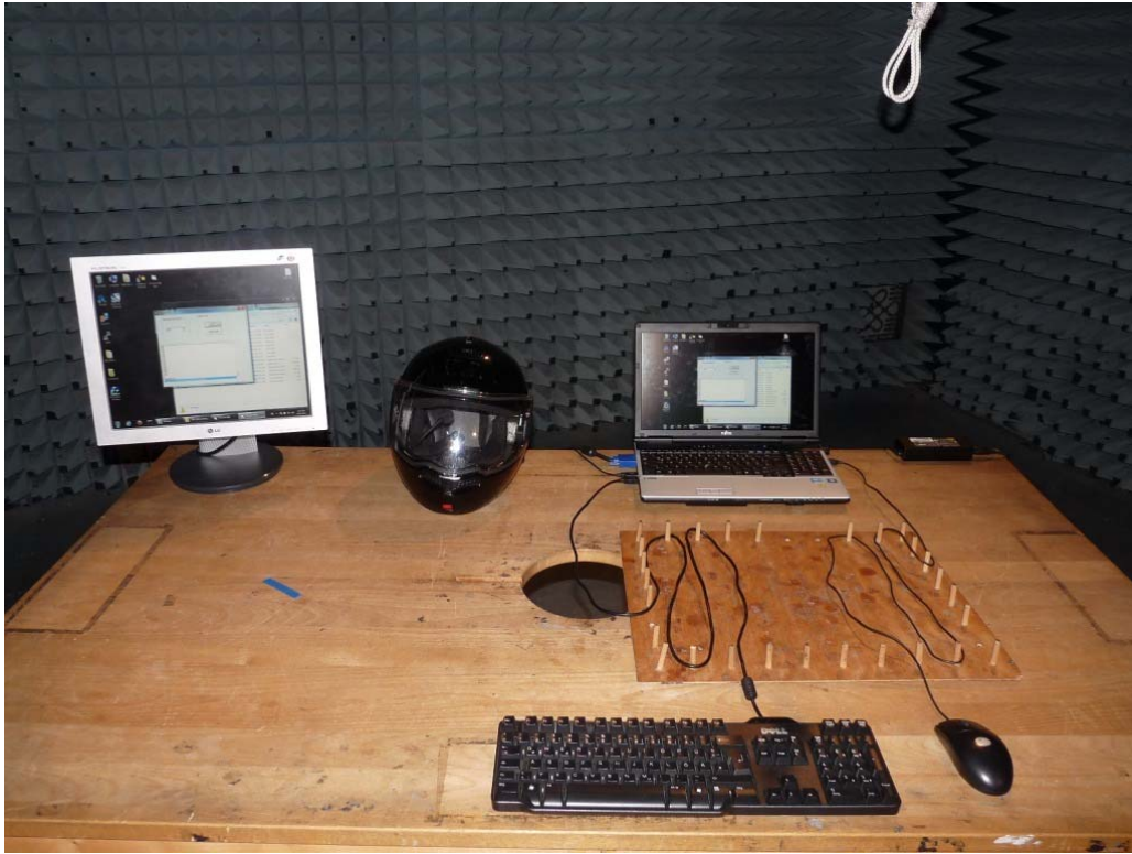
Photo 7: Test setup for radiated measurements (Enclosure, 30 MHz to 1 GHz), unintentional transmission, EUT + computer peripheral setup