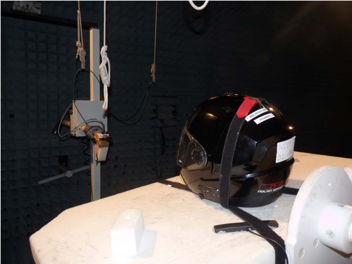
Photo 4: Test setup for radiated measurements (Enclosure, above 18 GHz)