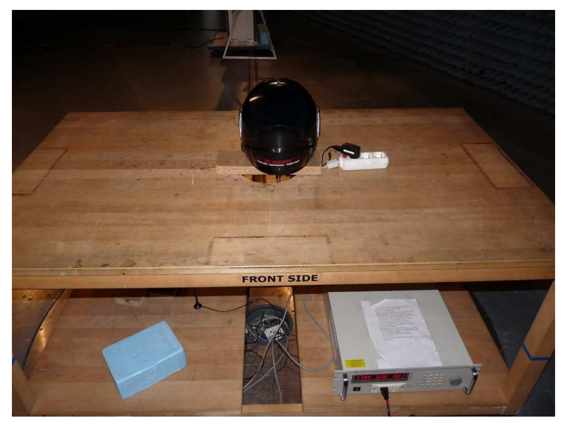
Photo 6: Test setup for radiated measurements (Enclosure, 30 MHz to 1 GHz), unintentional transmission, EUT + AC/DC adapter