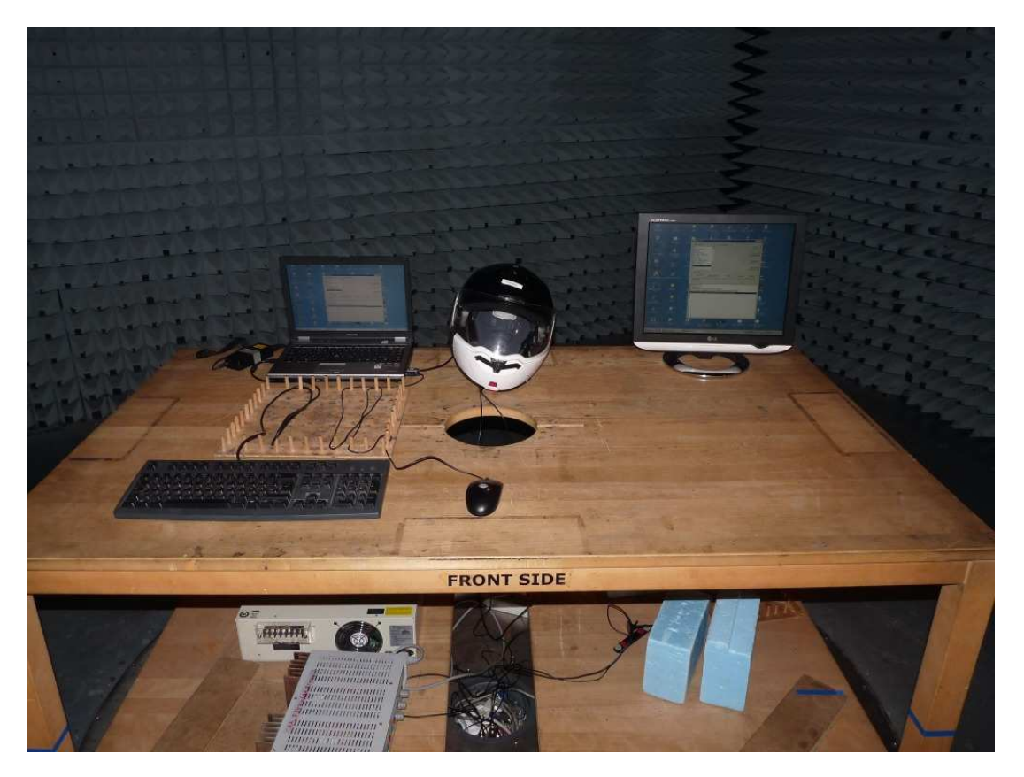
Photo 7: Test setup for radiated measurements (Enclosure, 30 MHz to 1 GHz), unintentional transmission, EUT + computer peripheral setup