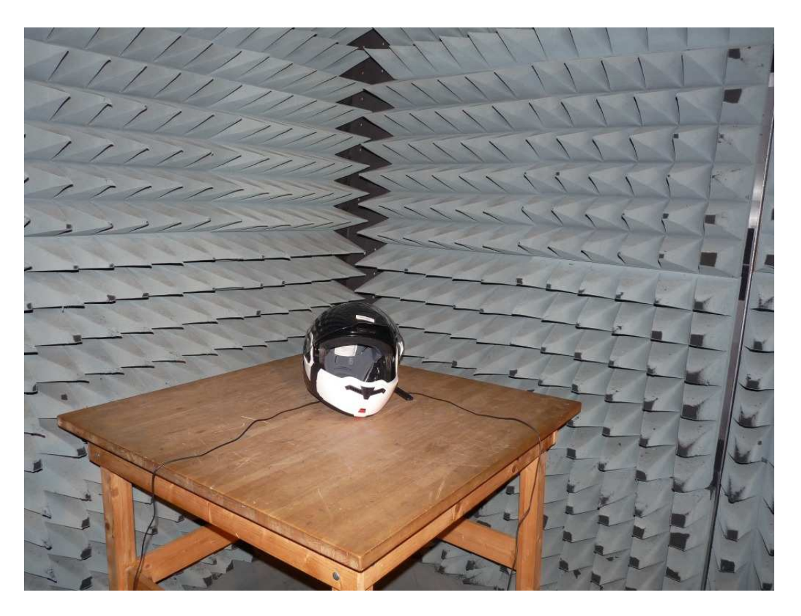
Photo 1: Test setup for radiated measurements (Enclosure, below 30 MHz)