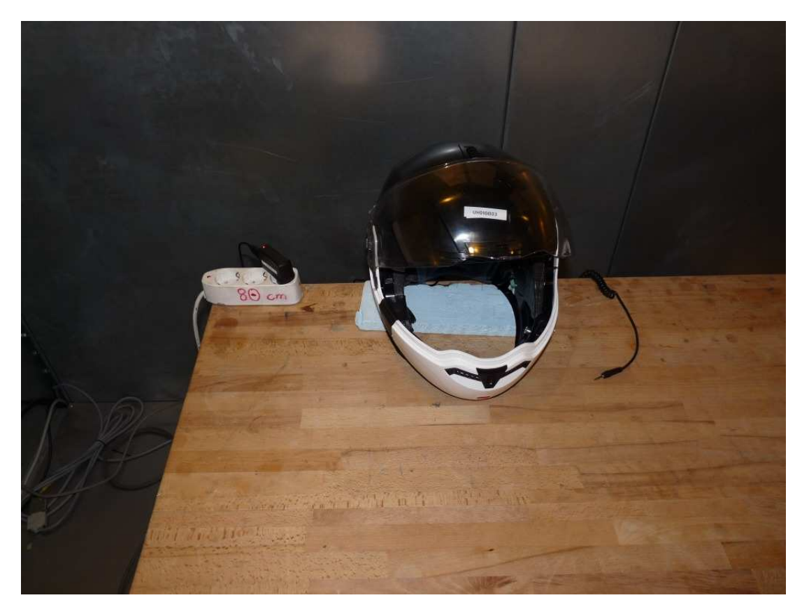
Photo 4: Test setup for conducted measurements (AC Port (power line)), unintentional transmission, EUT + AC/DC adapter