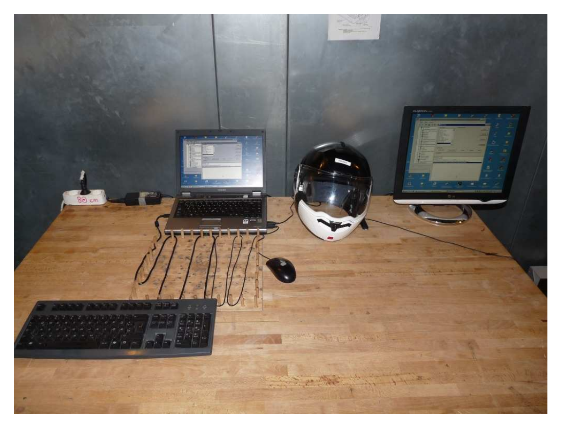
Photo 5: Test setup for conducted measurements (AC Port (power line)), unintentional transmission, EUT + computer peripheral setup