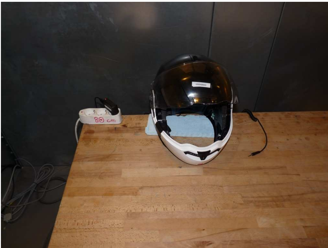
Photo 4: Test setup for conducted measurements (AC Port (power line)), unintentional transmission, EUT + AC/DC adapter