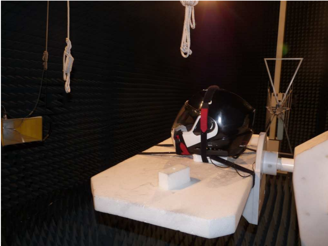
Photo 3: Test setup for radiated measurements (Enclosure, above 1 GHz)