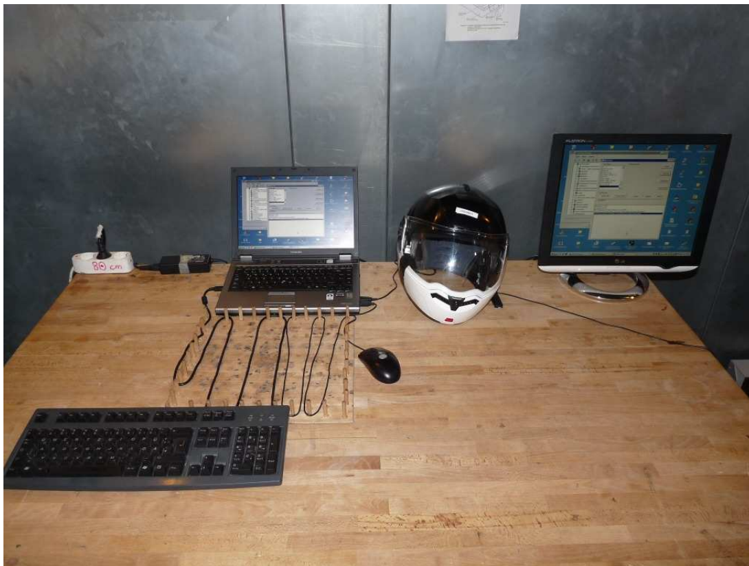
Photo 5: Test setup for conducted measurements (AC Port (power line)), unintentional transmission, EUT + computer peripheral setup