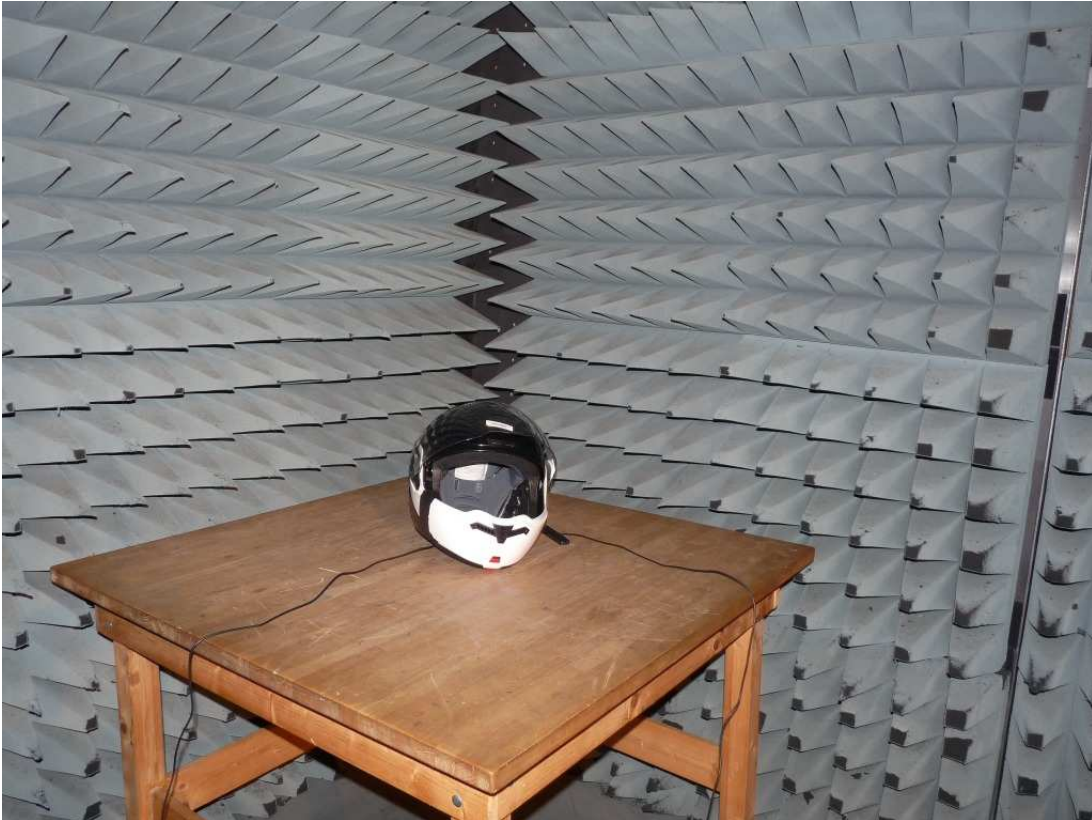
Photo 1: Test setup for radiated measurements (Enclosure, below 30 MHz)