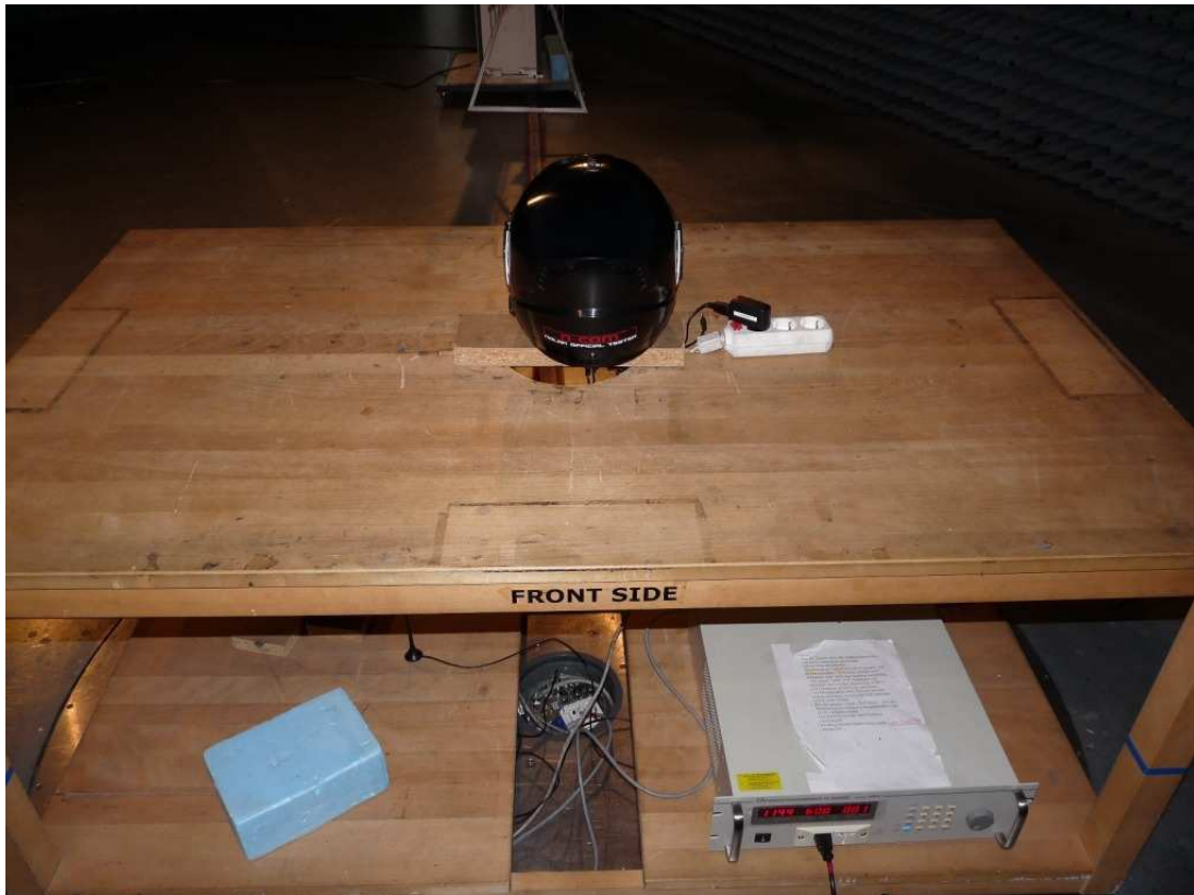
Photo 6: Test setup for radiated measurements (Enclosure, 30 MHz to 1 GHz), unintentional transmission, EUT + AC/DC adapter