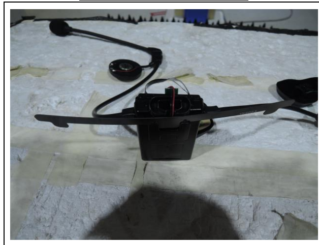
EUT Position: Z-axis