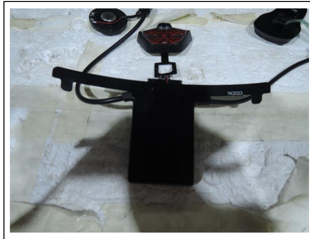
EUT Position: Y-axis