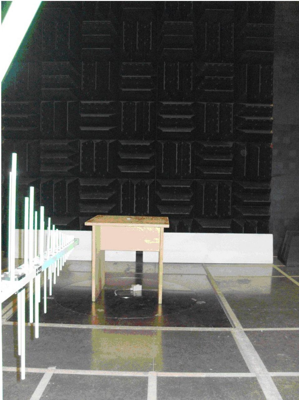
Fig. 9.1 Test Set-up