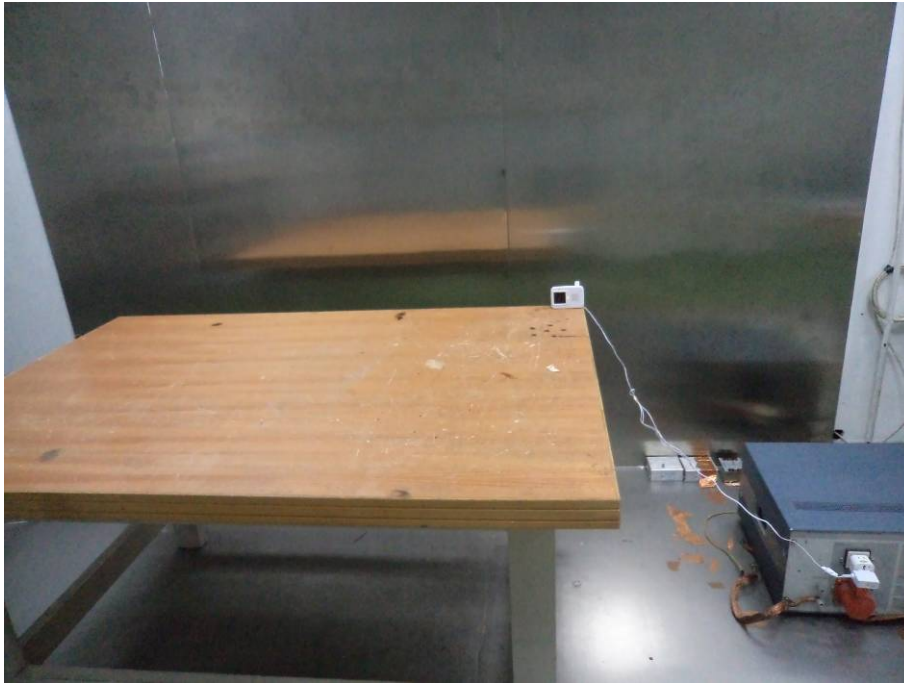
Conducted Emission Side View