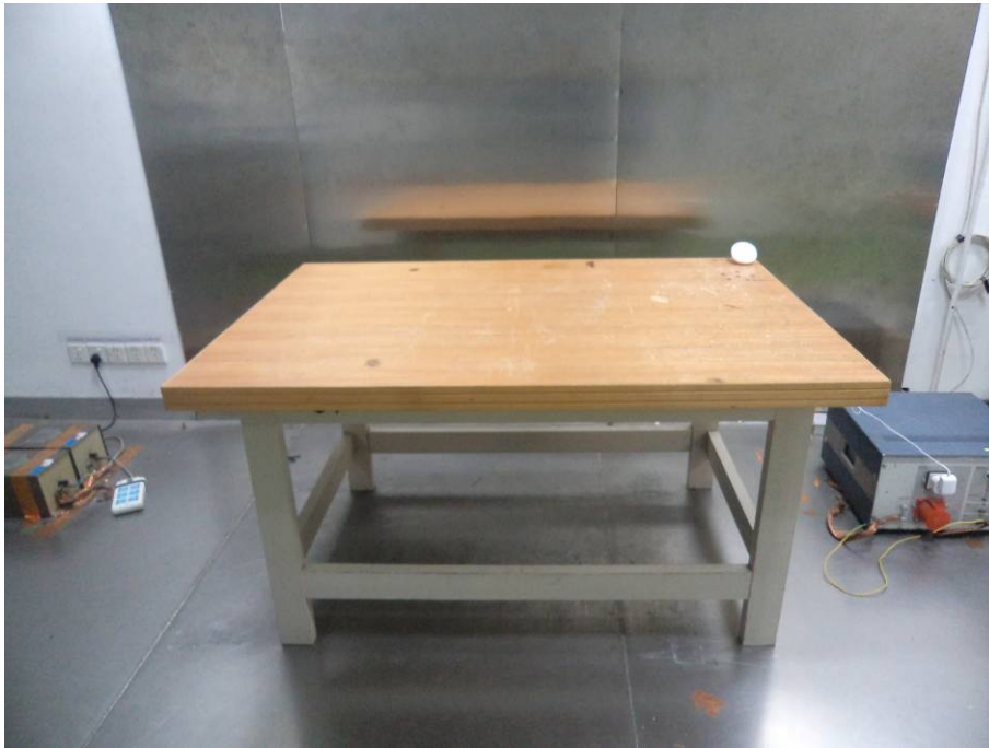
Conduction Emissions – Side View