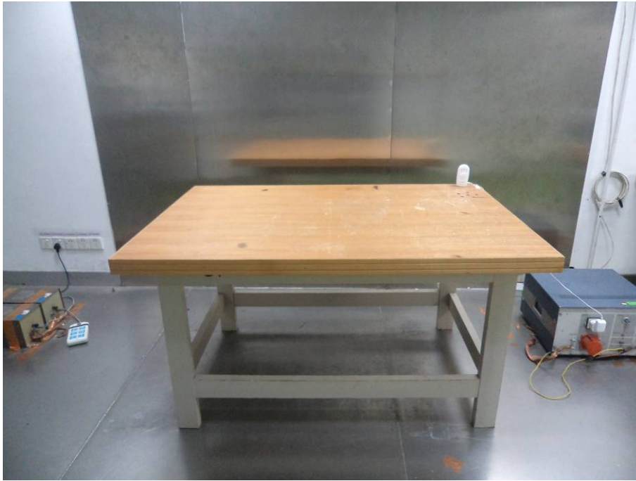
Conduction Emissions – Side View