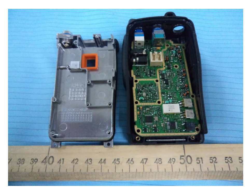
EUT – Cover off View 1