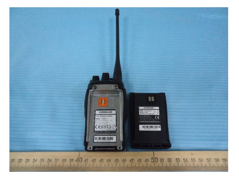
EXHIBIT C - EUT INTERNAL PHOTOGRAPHS