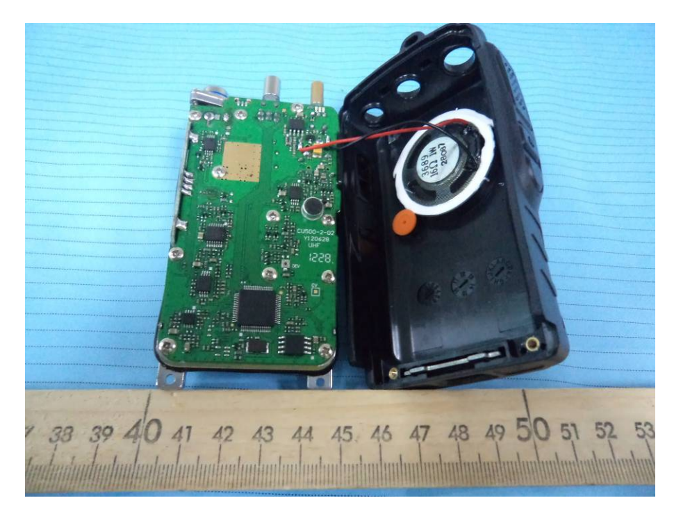
EUT – Main Board Top View