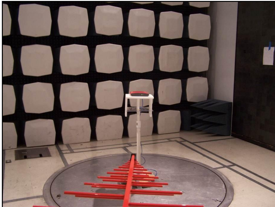
Photograph 4. Radiated Emissions, Test Setup 2