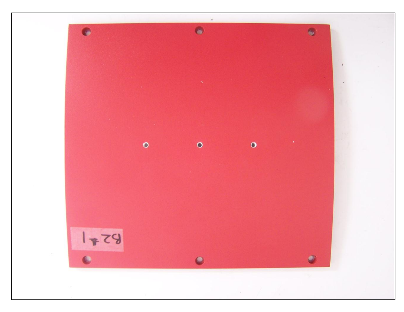
Photograph 2. outside of bottom cover