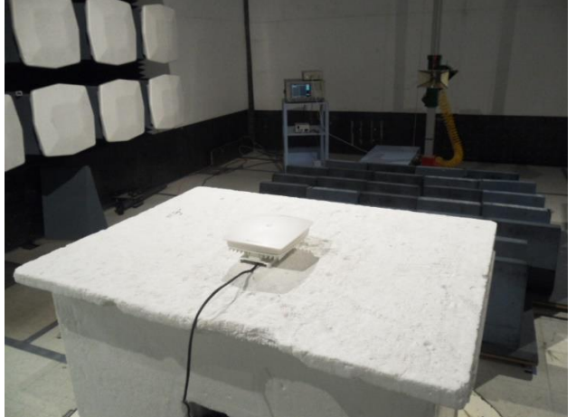
Radiated Emissions (>1GHz) – Rear View

Note: The spurious emission in different EUT orientation was investigated, including the EUT standing up position and the laying down position. The EUT orientation shown in above setup photo is the worst case position.