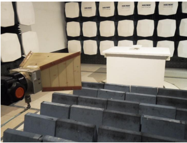
Radiated Emissions (>1GHz) – Front View