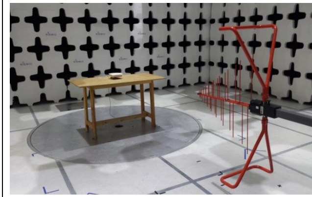
Radiated Emissions (<1GHz) – Front View