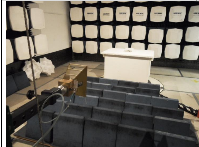
Radiated Emissions (>1GHz) – Front View