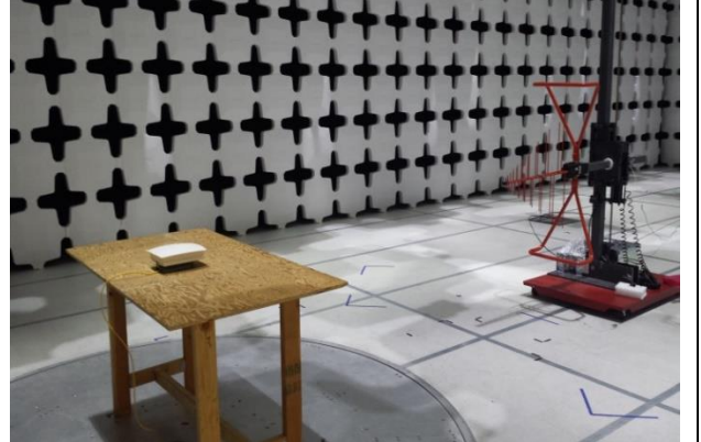
Radiated Emissions (<1GHz) – Rear View