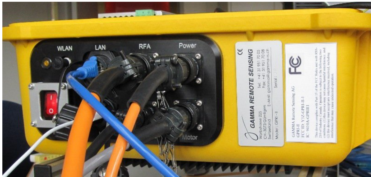
Figure 2: Side view of the Instrument Controller Box with CE and FCC labels.