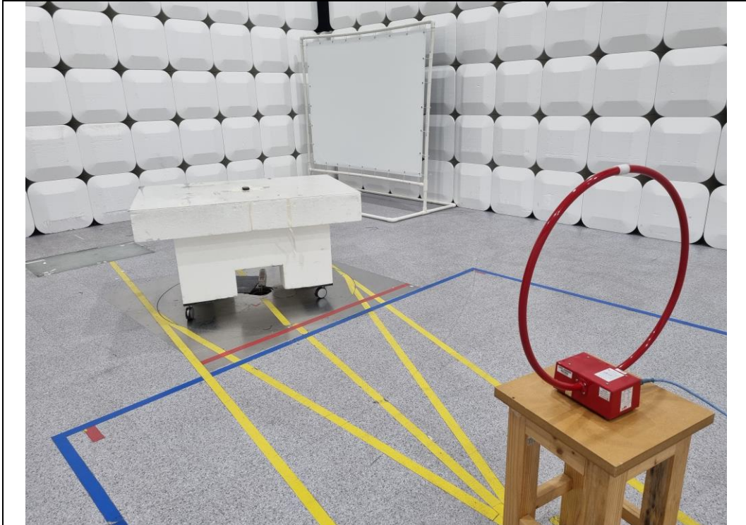
Test distance : 3 m, height of table : 0.8 m