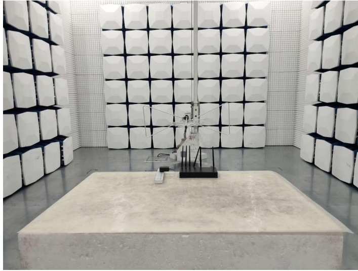
Radiated Emission (Below 1G)