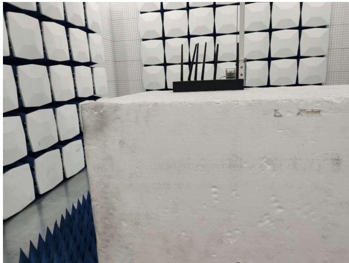
Radiated Emission (Above 1G)