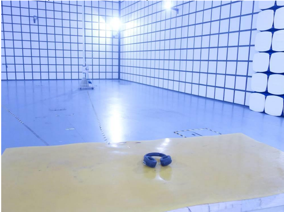
Radiated Spurious Emissions Setup Photo