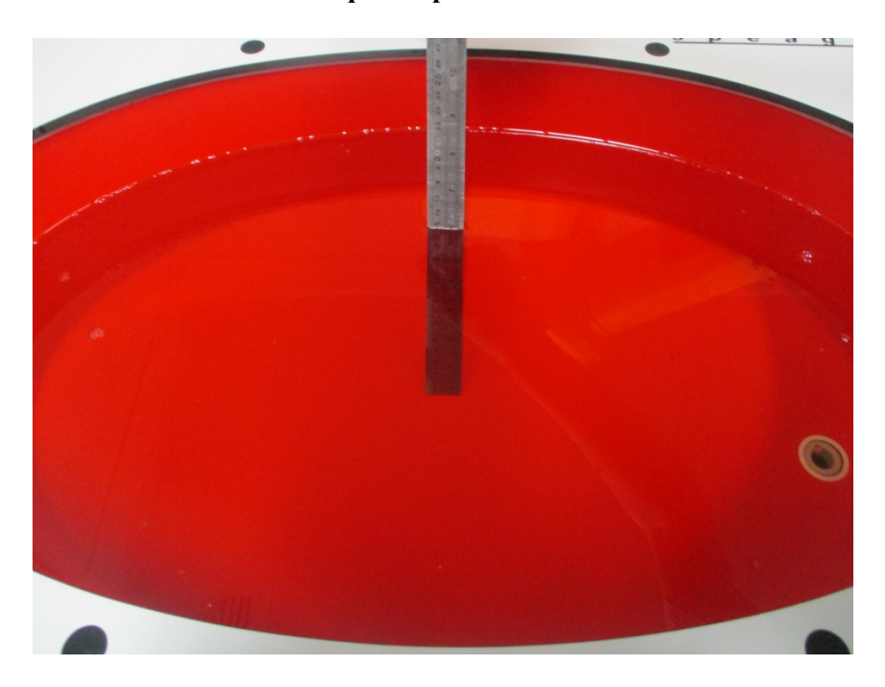
Liquid depth ≥ 15cm