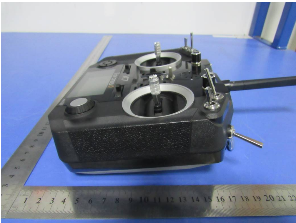
Right View of EUT