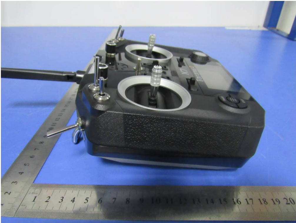
Left View of EUT