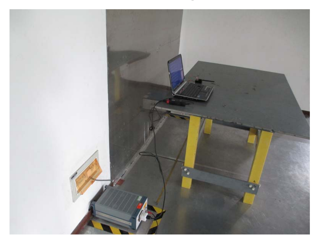
Conducted Emissions Test Setup Side View