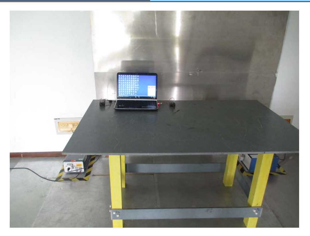
Conducted Emissions Test Setup Front View