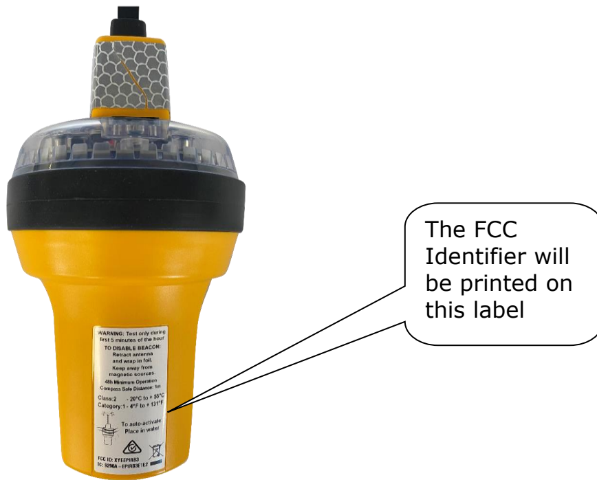
Figure 4: SafeSea EPIRB3 PRO – Rear View (Antenna Not Shown for Clarity)