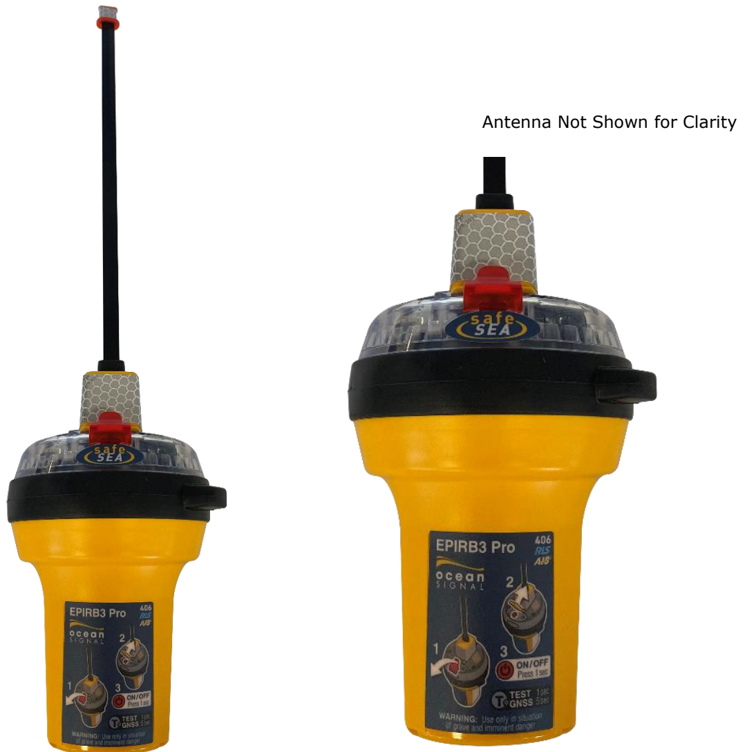
Figure 1: SafeSea EPIRB3 PRO – Front View (Including Fixed Antenna in Deployed Configuration)

External photographs of the SafeSea EPIRB3 PRO are shown below in Figures 1 to 6.