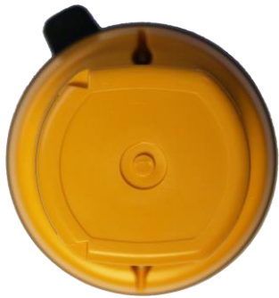
Figure 6: SafeSea EPIRB3 PRO – Base View