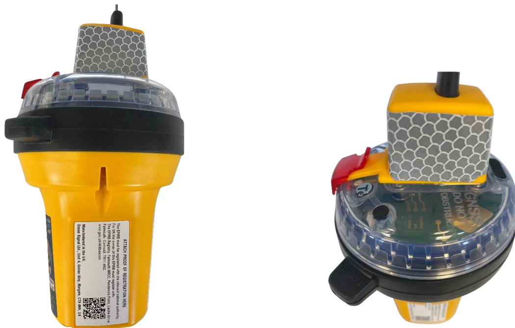
Figure 3: SafeSea EPIRB3 PRO - Left Hand Side View (Antenna Not Shown for Clarity)