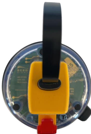
Figure 5: SafeSea EPIRB3 PRO - Top View (Including Fixed Antenna in Stowed Configuration)