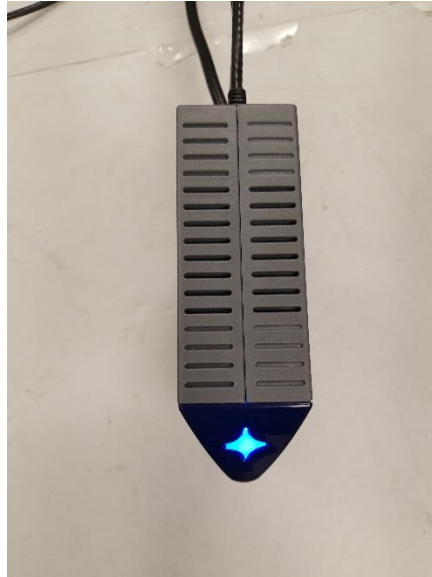
Photograph 5. CNX-WiFi, Top Side