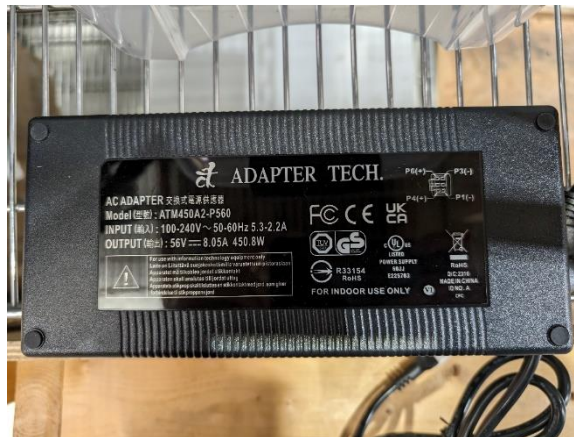
Photograph 11. 450 Watt AC Adapter