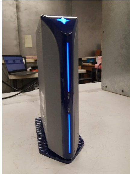
Photograph 1. CNX-WiFi, Front Side