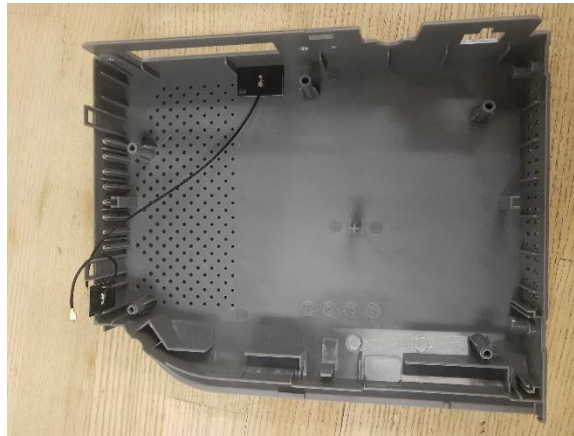
Photograph 10. CNX-WiFi, Internal 5 GHz Antenna Position