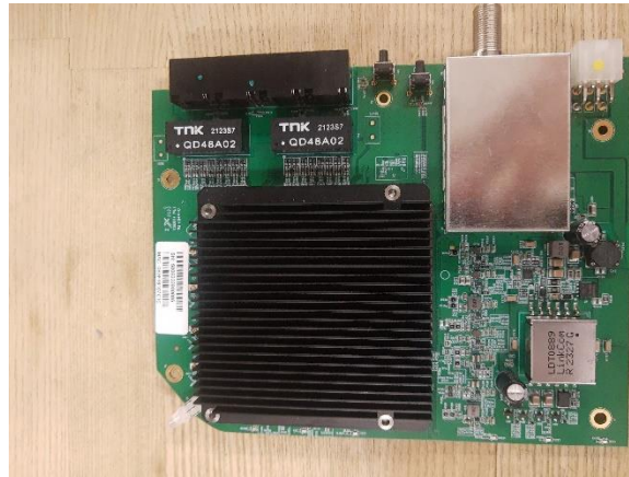
Photograph 7. CNX-WiFi, Internal Board, Side 1