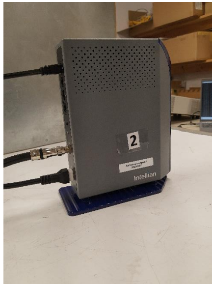
Photograph 2. CNX-WiFi, Right Side