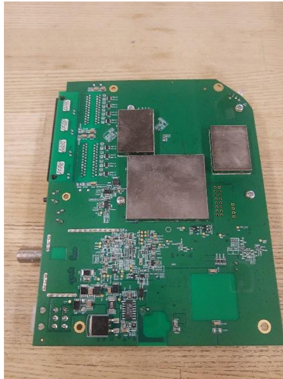
Photograph 8. CNX-WiFi, Internal Board, Side 2