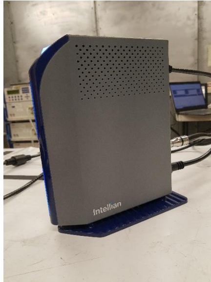
Photograph 3. CNX-WiFi, Left Side