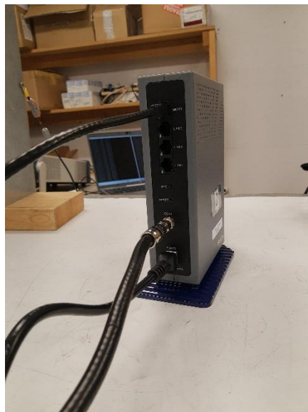
Photograph 4. CNX-WiFi, Rear Side