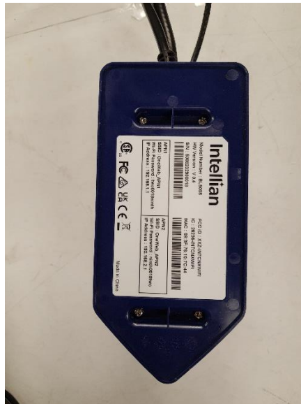
Photograph 6. CNX-WiFi, Bottom Side