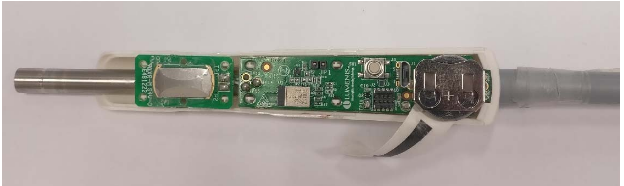
Photograph No.1 OPTIMA Treatment Hand-Piece internal view