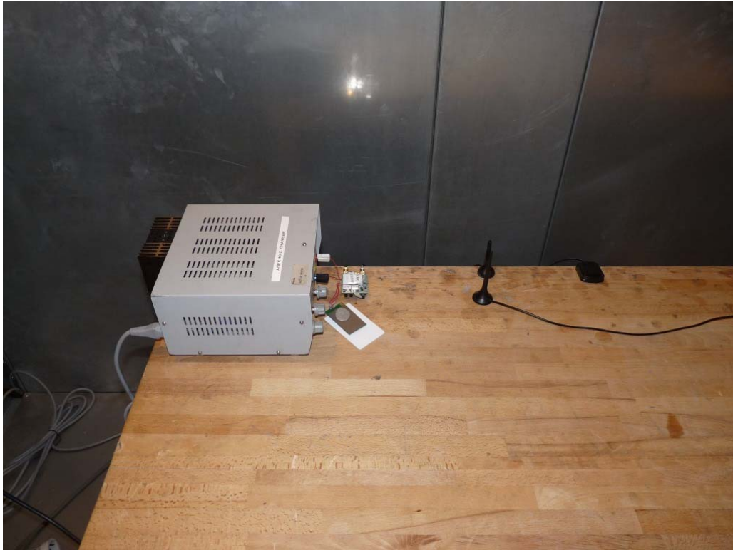
Photo 5: Test setup for conducted measurements (AC Port (power line), EUT supplied by external power supply, intentional / unintentional radiator §15)